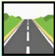
60 ft- BT Roads, 40 ft - CC Roads