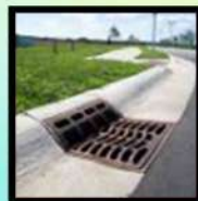
Storm Water Drains