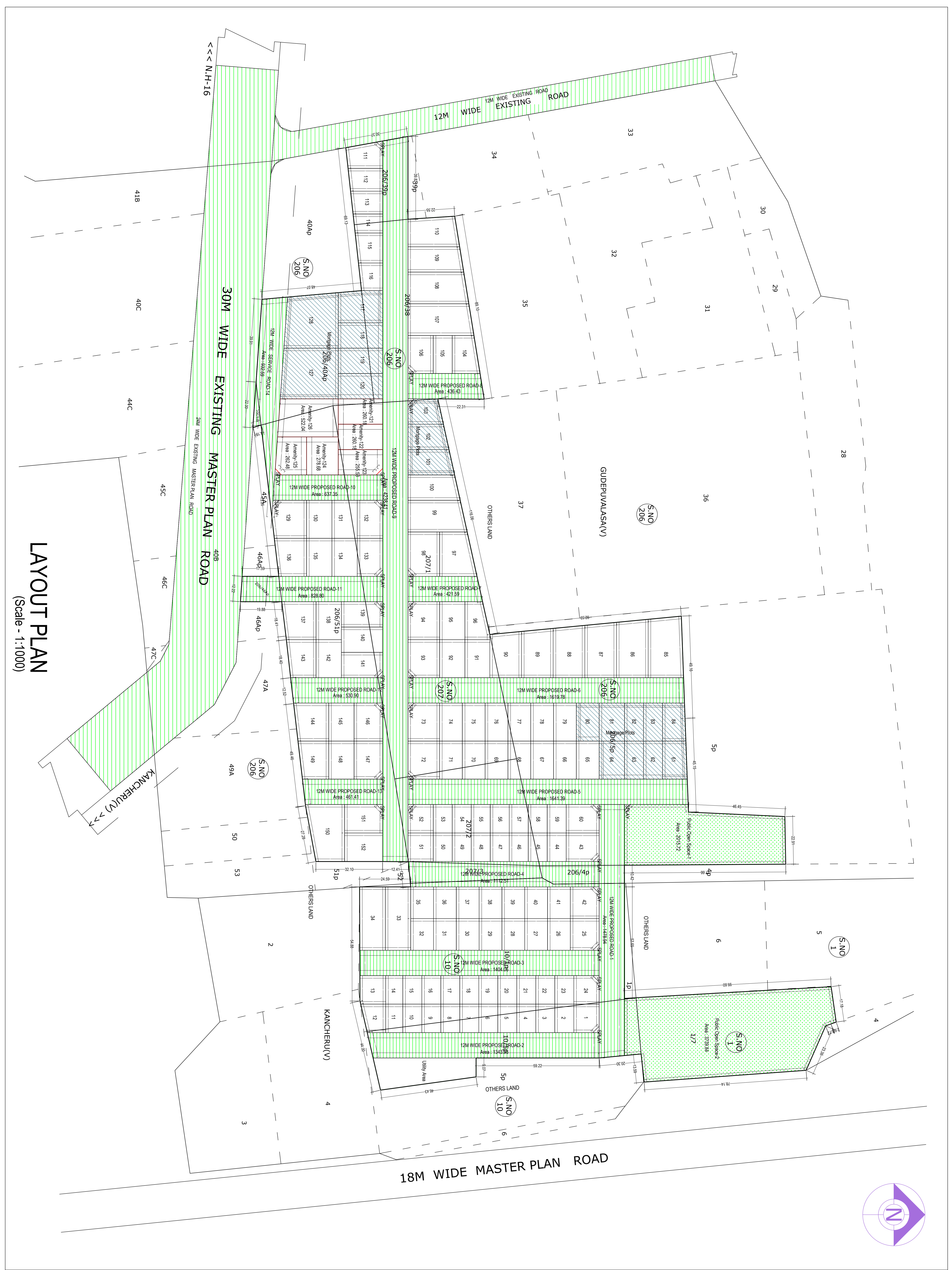
LAYOUT PLAN (Scale - 1:1000)