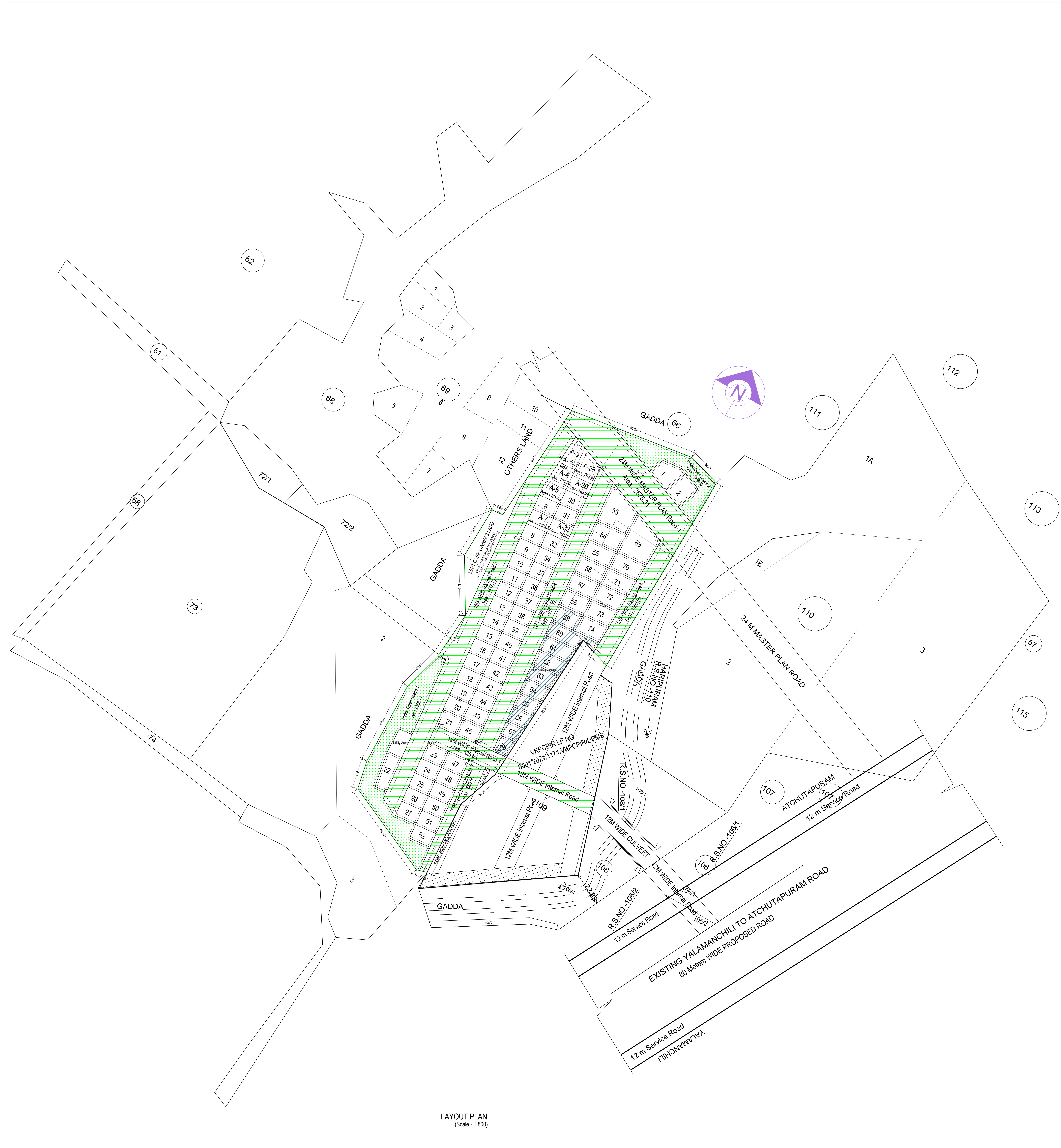
LAYOUT PLAN (Scale - 1:800)