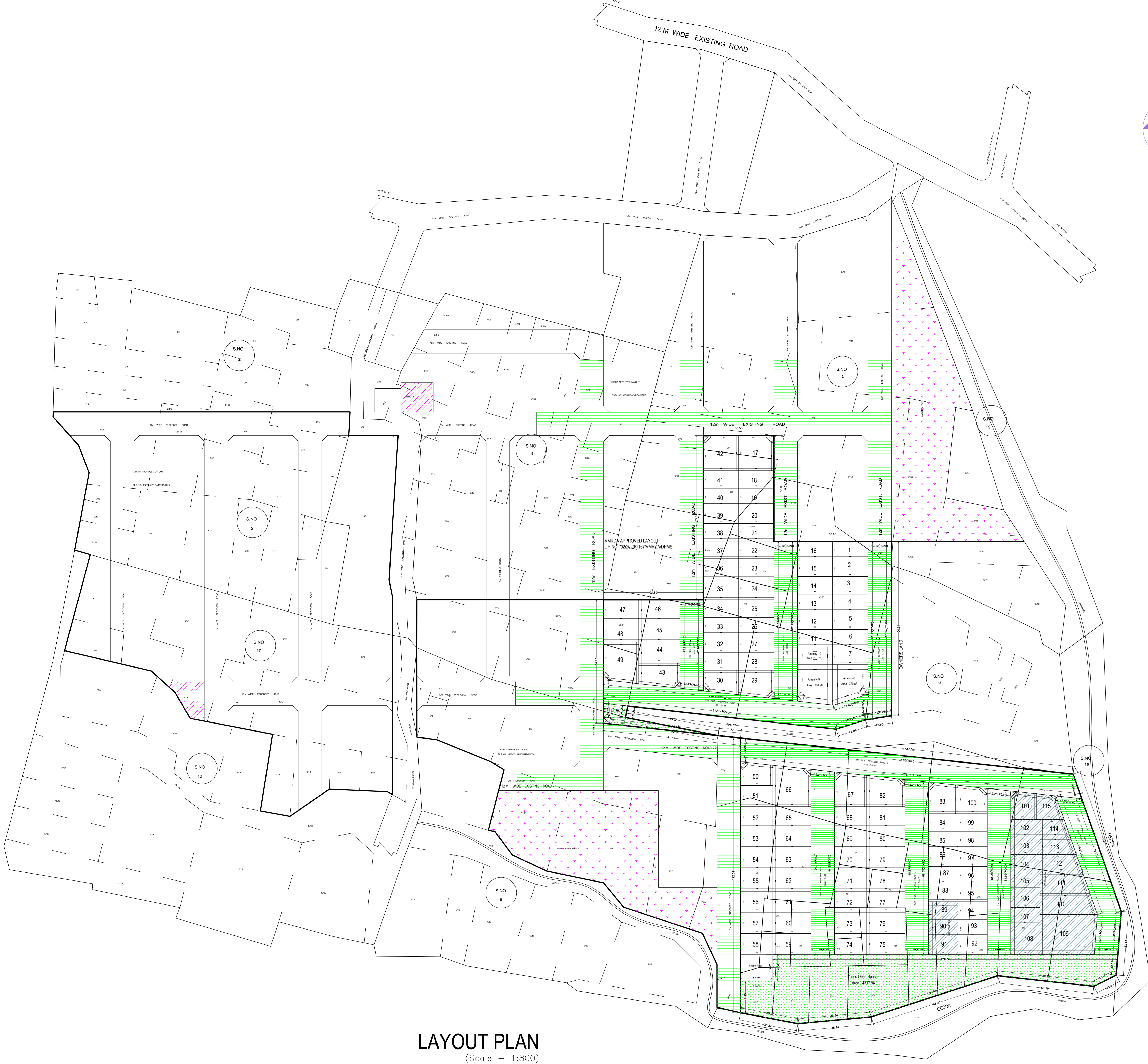
LAYOUT PLAN (Scale - 1:800)

Project Title : PROPOSED LAYOUT IN SY. NOS.3/27P,29P, 5/P,7P,8P,12P, 15/P,3P,4P,6,7,8,9,10P,11P,12P, 7/1P,2,3P,4,5,6,7,8P,9,10,11P,12,13,14,15,16,17,18,19, 20,21P,2,3,4,5,25,26,27 & 9/6P OF MAJUVILASA VILLAGE, BHEEMUNIPATNAM MANDAL, VISAKHAPATNAM DISTRICT, Bhattarangi M.V. SUBHAGRHA INFRASTRUCTURES PVT. LTD. PROPOSED LAYOUT IN SY. NOS.3/27P,29P, 5/P,7P,8P,12P, 15/P,3P,4P,6,7,8,9,10P,11P,12P, 7/1P,2,3P,4,5,6,7,8P,9,10,11P,12,13,14,15,16,17,18,19, 20,21P,2,3,4,5,25,26,27 & 9/6P OF MAJUVILASA VILLAGE, BHEEMUNIPATNAM MANDAL, VISAKHAPATNAM DISTRICT, Bhattarangi M.V. SUBHAGRHA INFRASTRUCTURES PVT. LTD. PROPOSED LAYOUT IN SY. NOS.3/27P,29P, 5/P,7P,8P,12P, 15/P,3P,4P,6,7,8,9,10P,11P,12P, 7/1P,2,3P,4,5,6,7,8P,9,10,11P,12,13,14,15,16,17,18,19, 20,21P,2,3,4,5,25,26,27 & 9/6P OF MAJUVILASA VILLAGE, BHEEMUNIPATNAM MANDAL, VISAKHAPATNAM DISTRICT, Bhattarangi M.V. SUBHAGRHA INFRASTRUCTURES PVT. LTD.