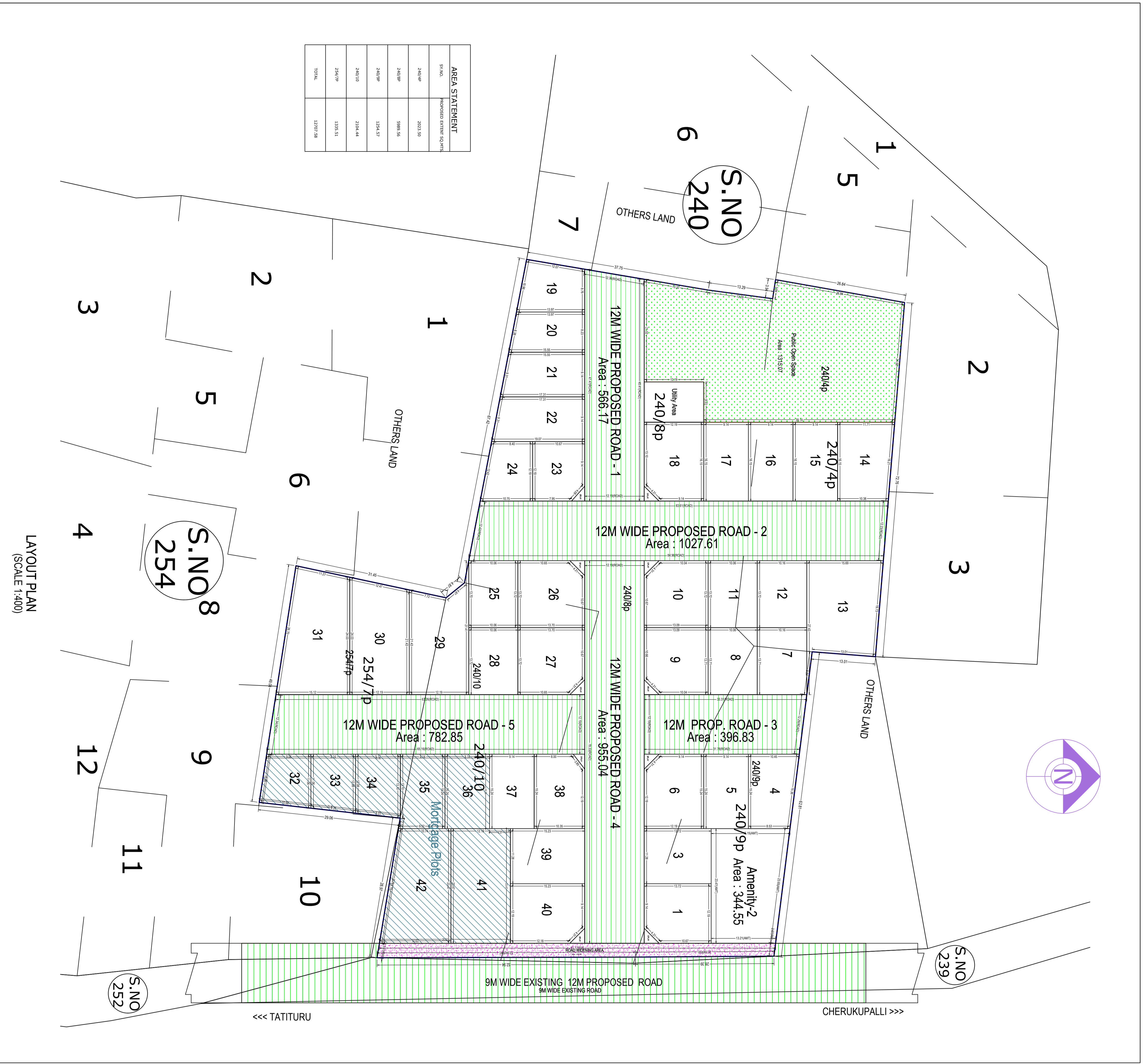
LAYOUT PLAN (SCALE 1:400)