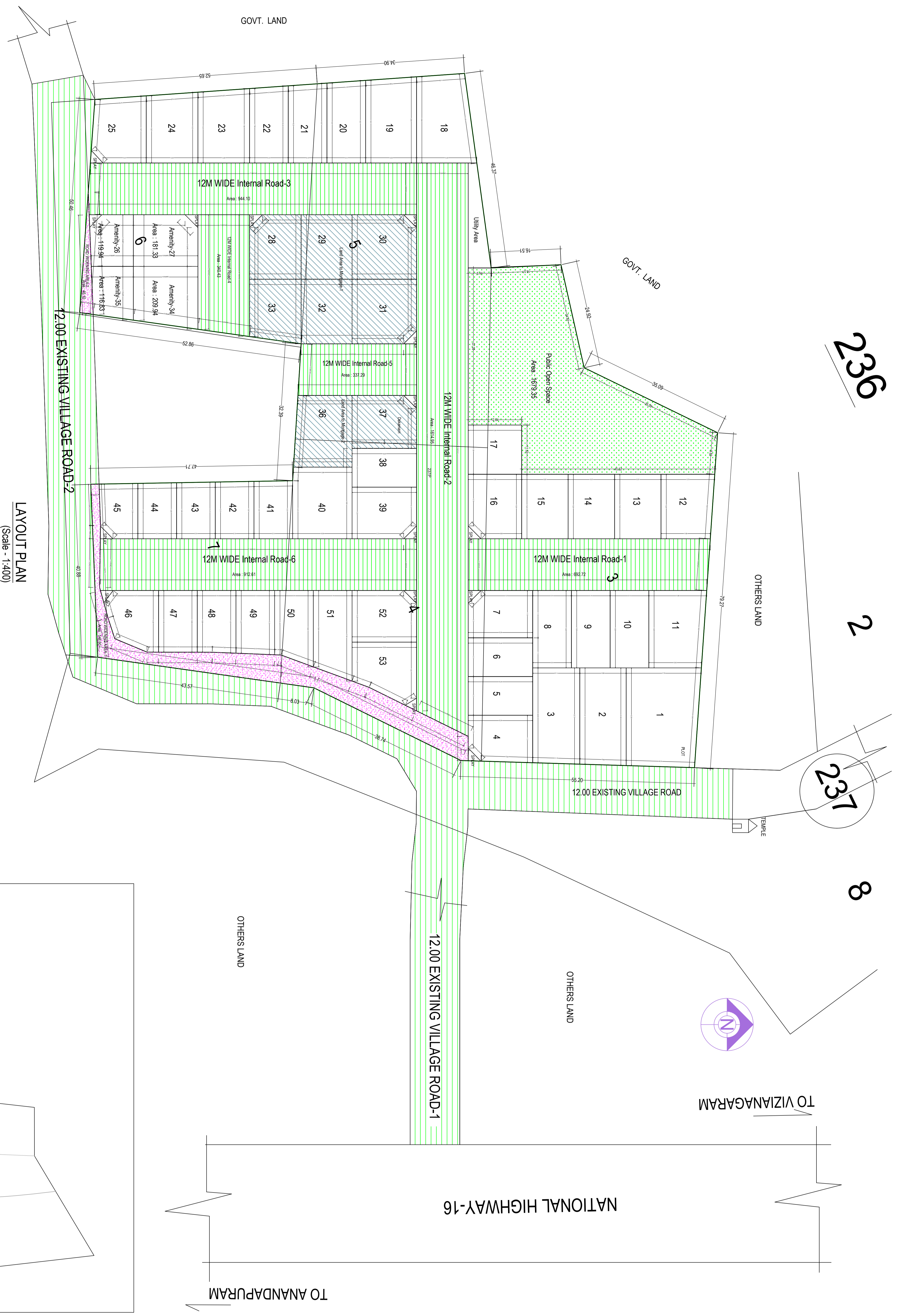
LAYOUT PLAN (Scale - 1:400)