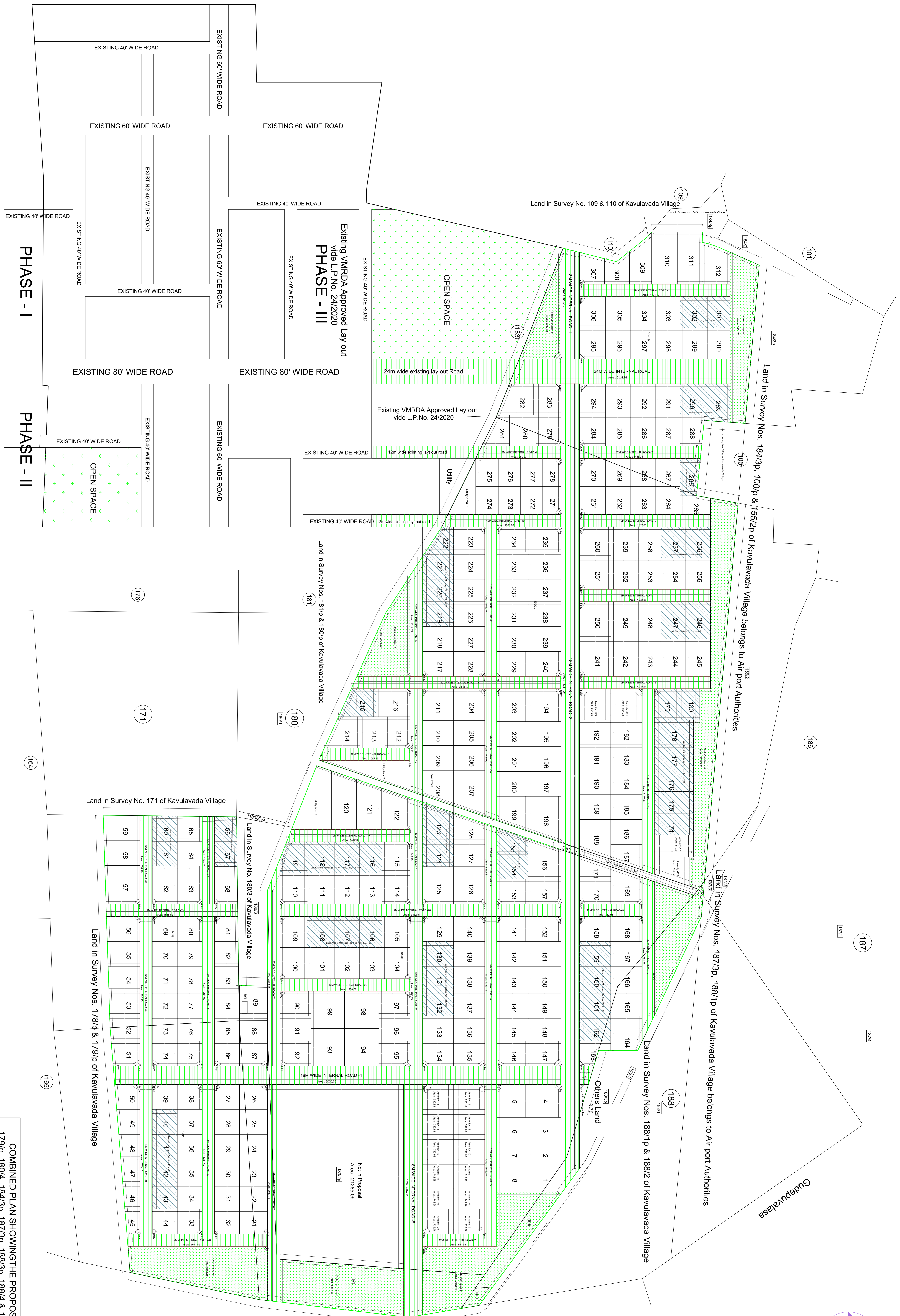
Site Plan (Scale: 1:1000)