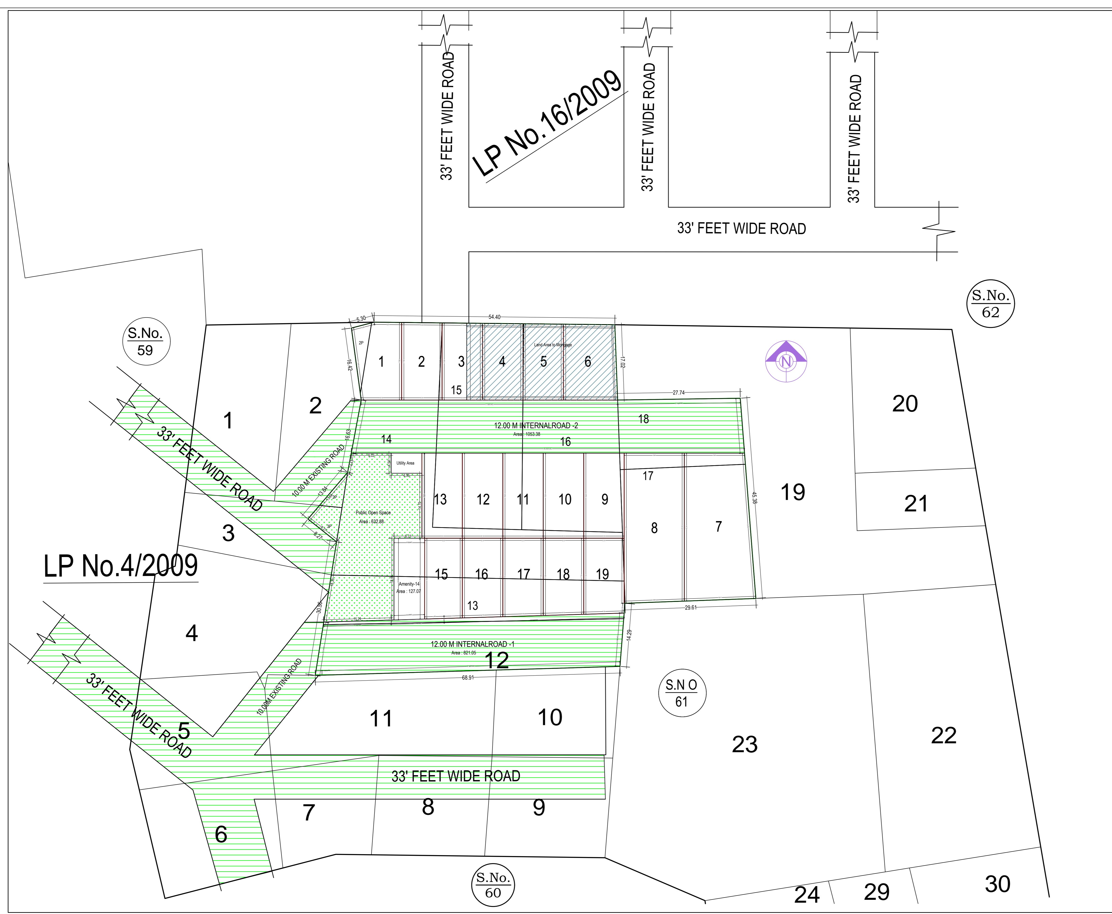
LAYOUT PLAN (Scale - 1:400)