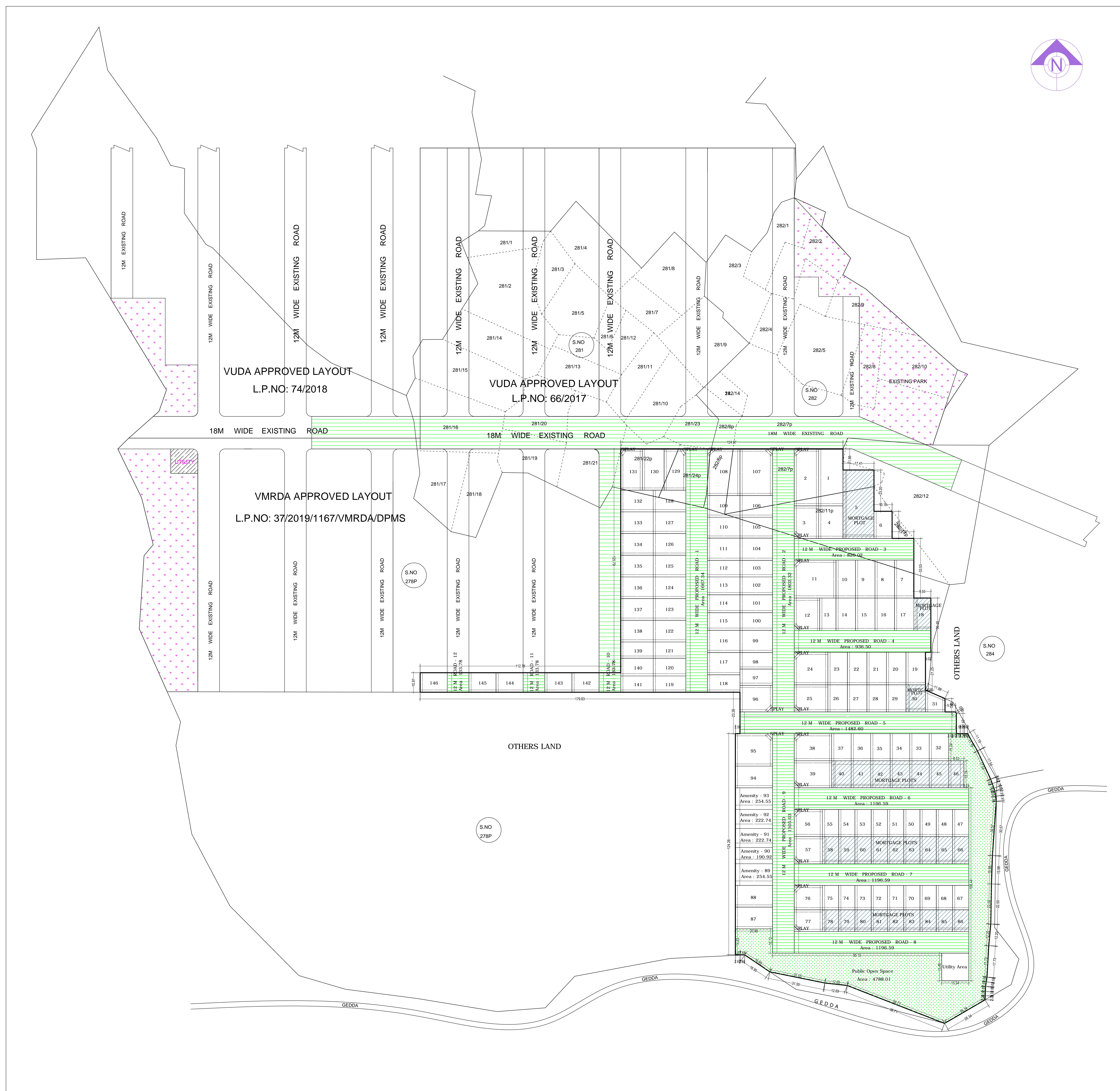
LAYOUT PLAN (Scale: 1:1000)