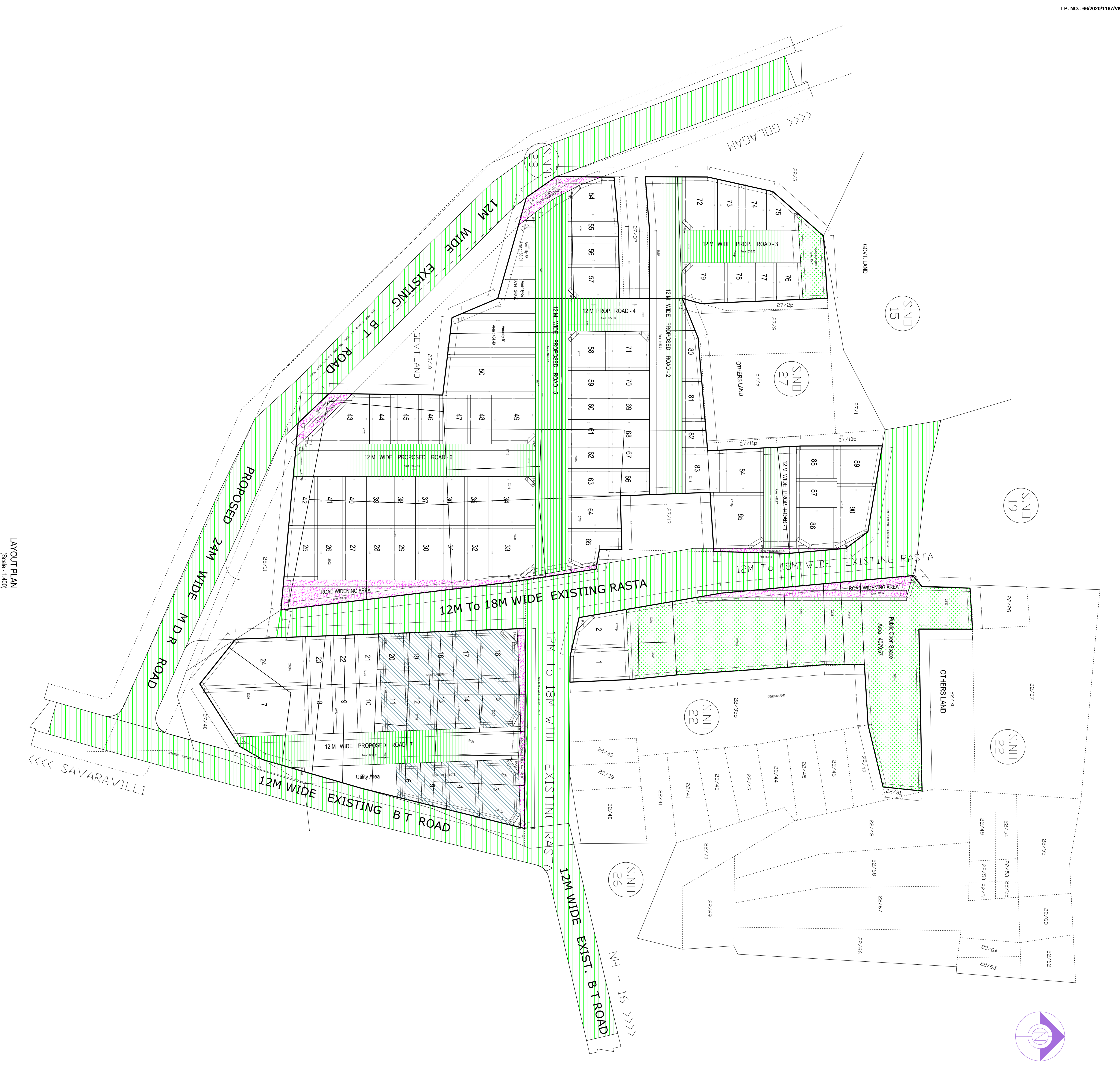
LAYOUT PLAN (Scale - 1:400)