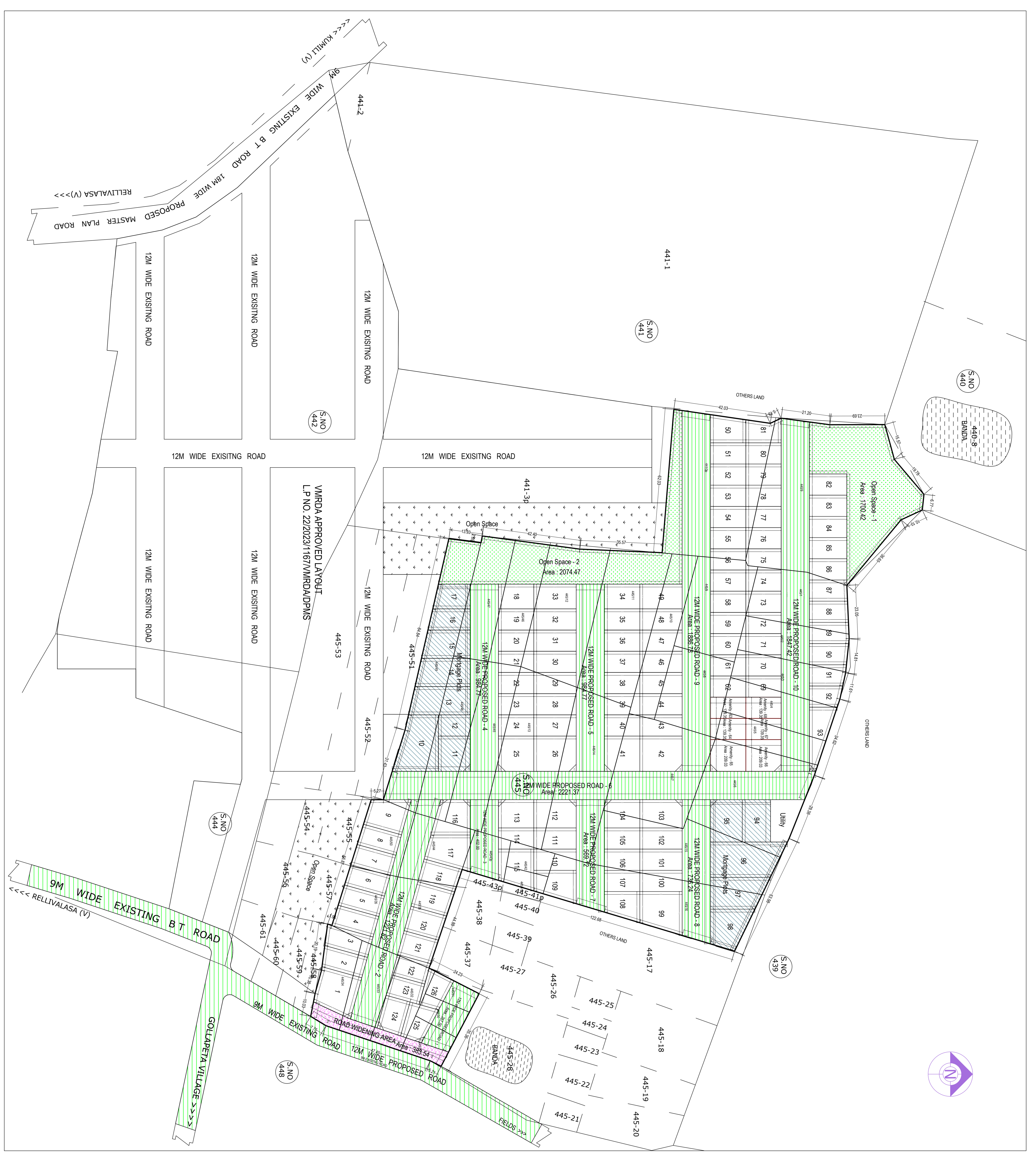
LAYOUT PLAN (Scale - 1:400)