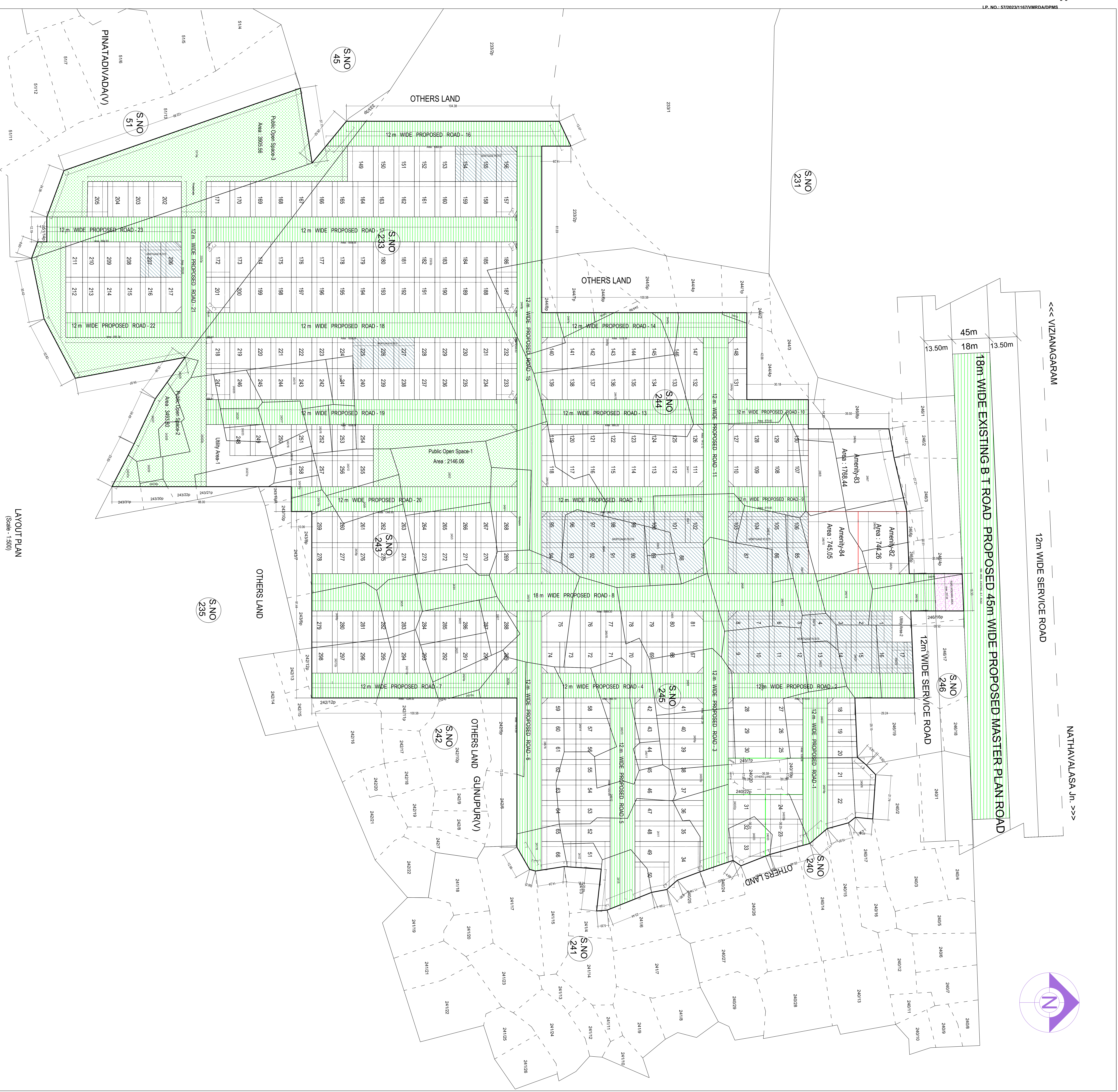
LAYOUT PLAN (Scale - 1:500)