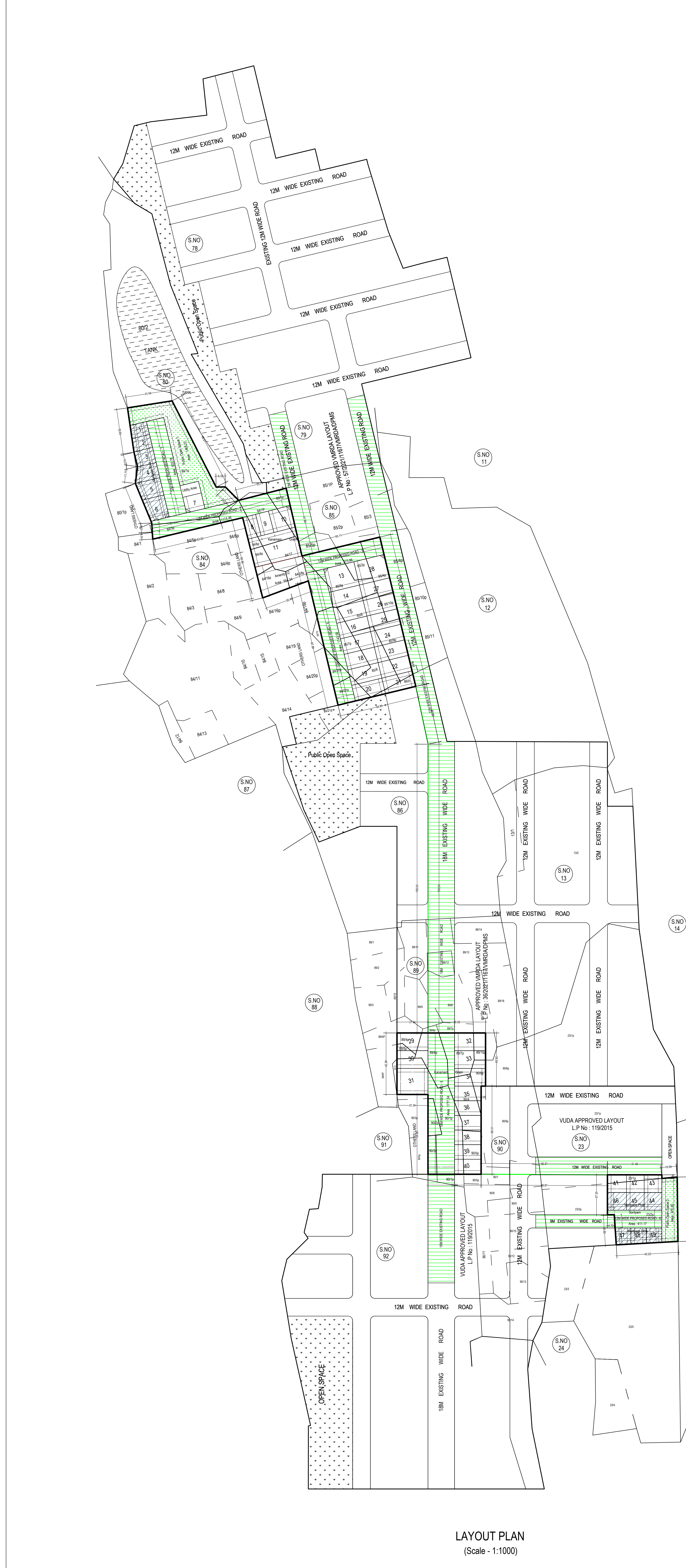
LAYOUT PLAN (Scale - 1:1000)