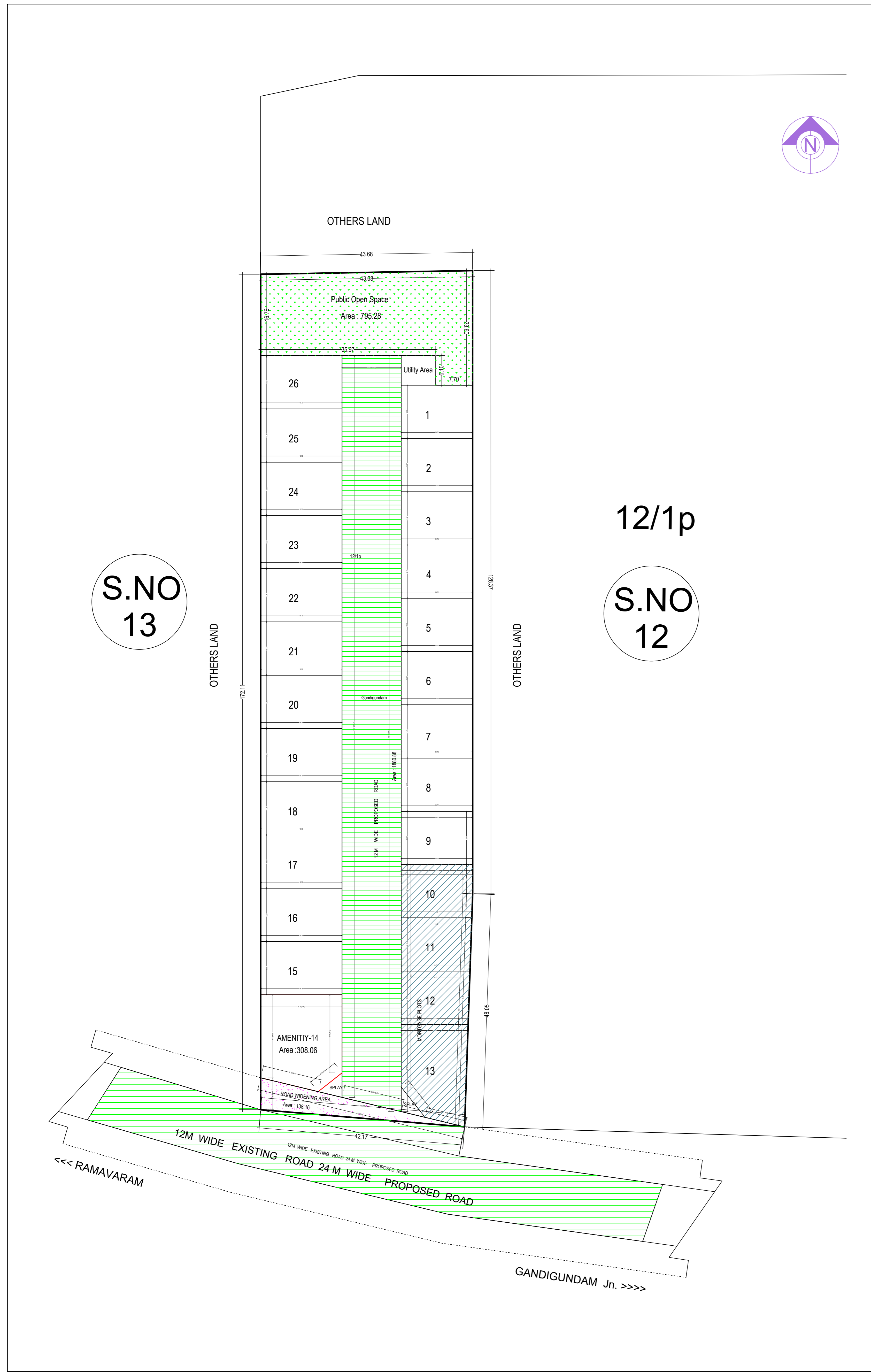
LAYOUT PLAN (Scale - 1:400)