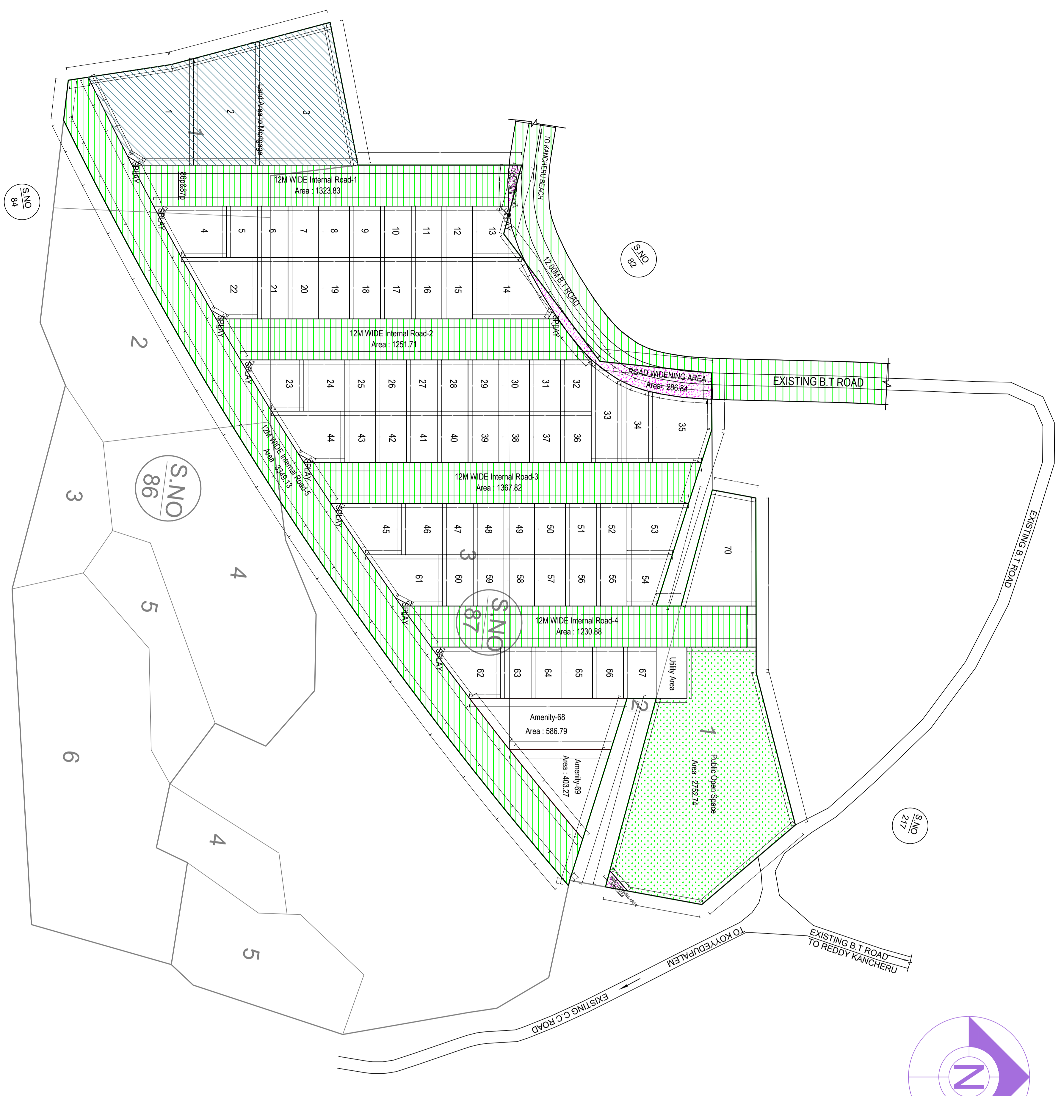
LAYOUT PLAN (Scale - 1:800)