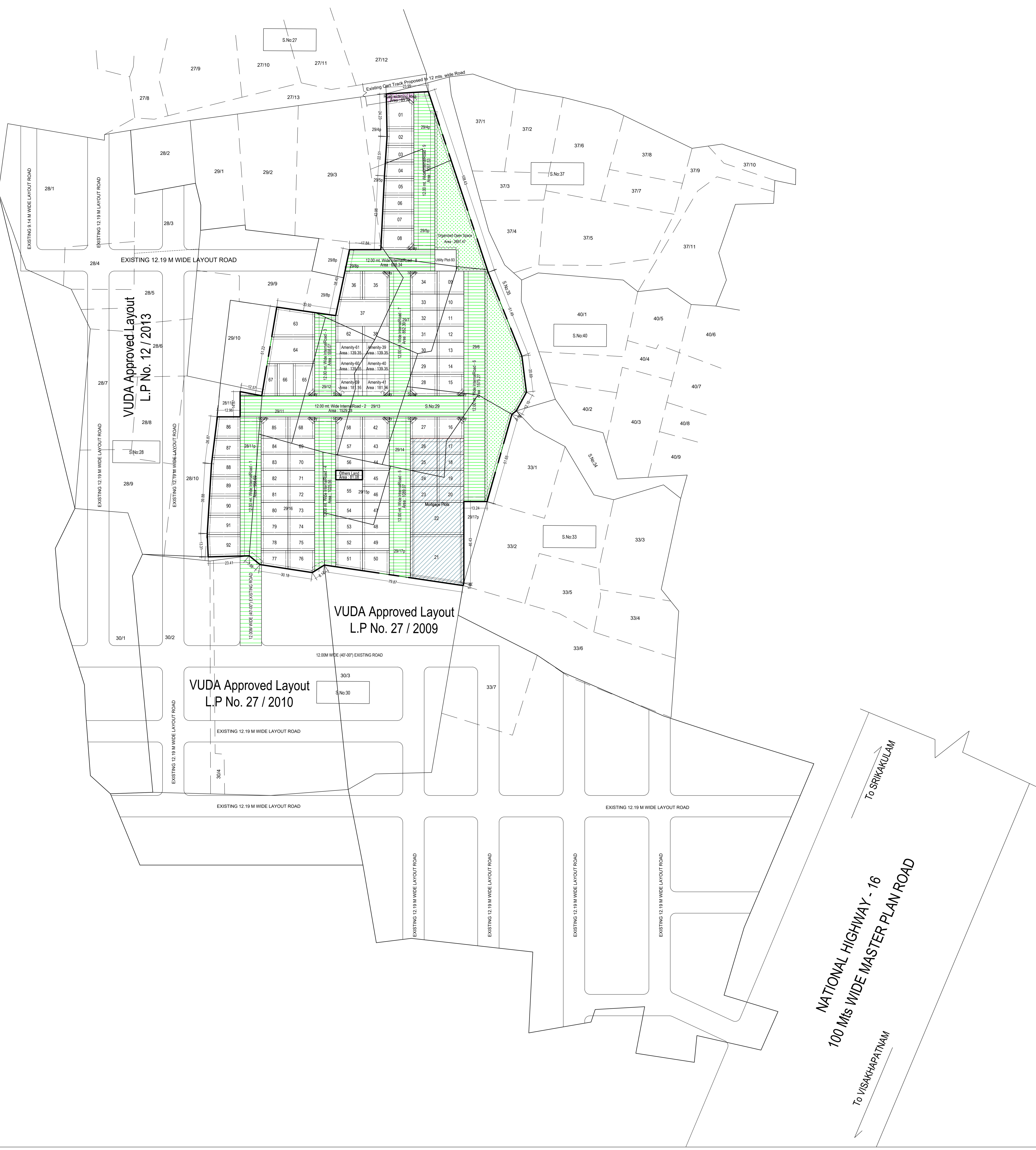
LAY-OUT PLAN (Scale : 1:800)