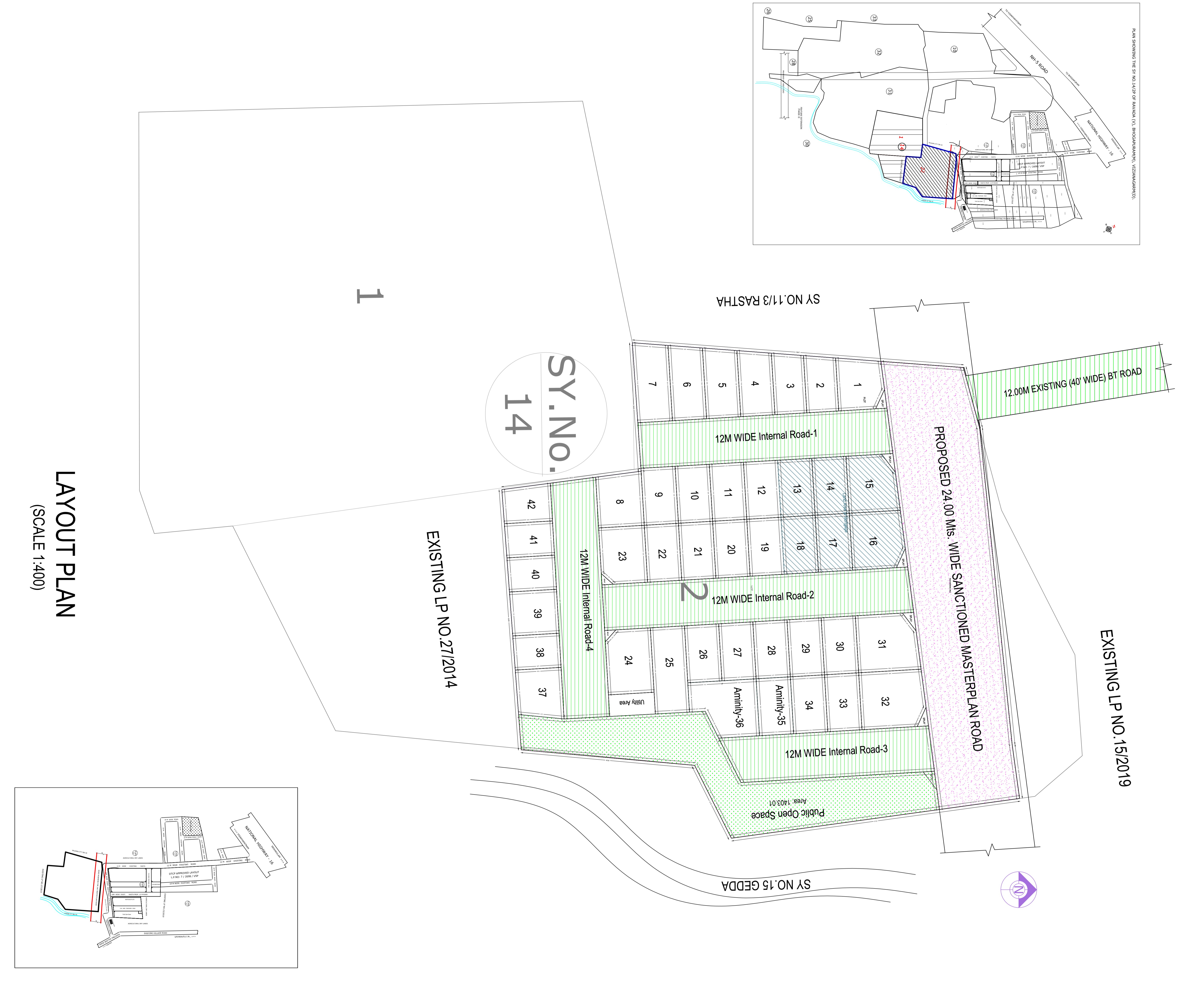
LAYOUT PLAN (SCALE 1:400)