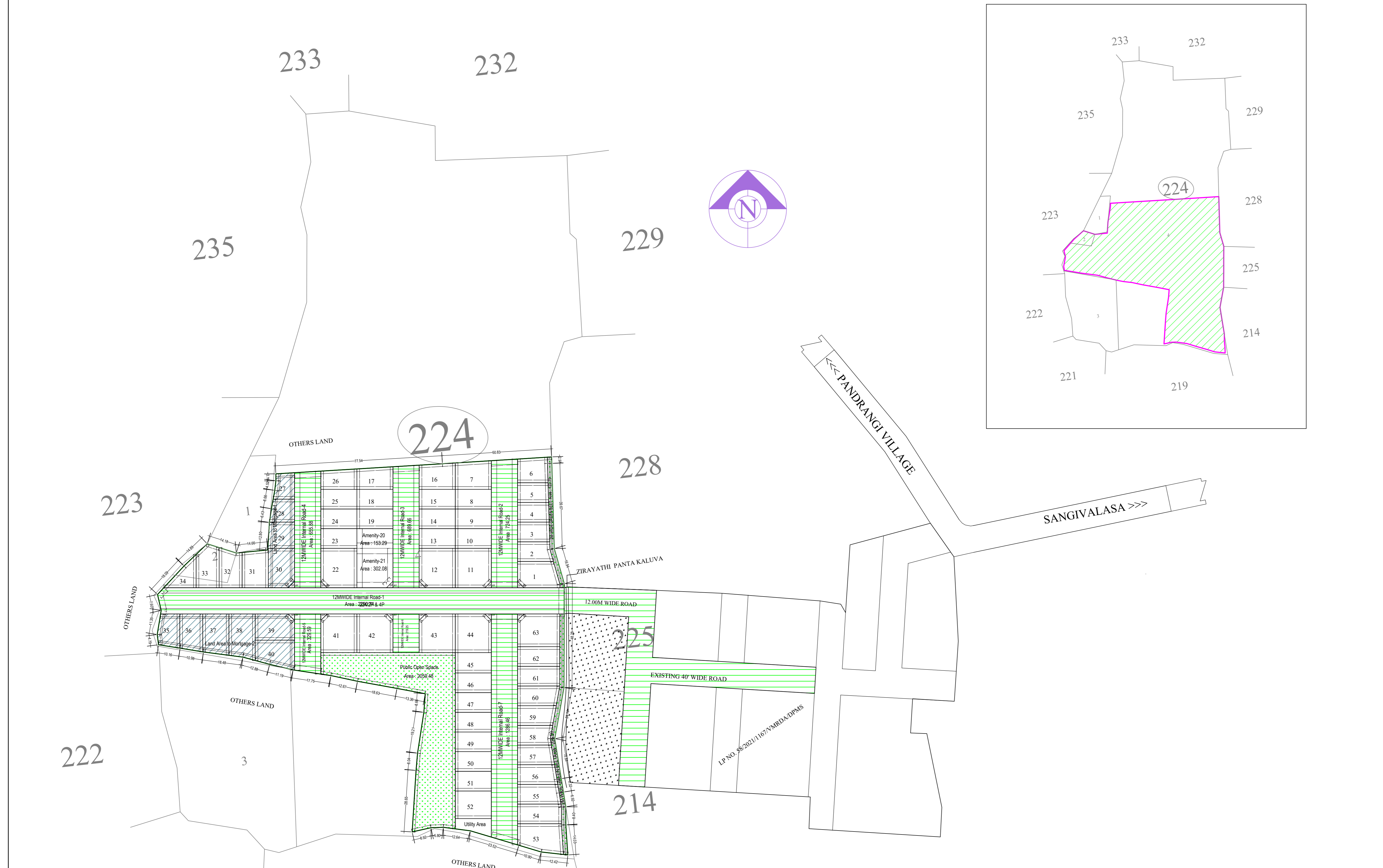
LAYOUT PLAN (Scale - 1:1000)