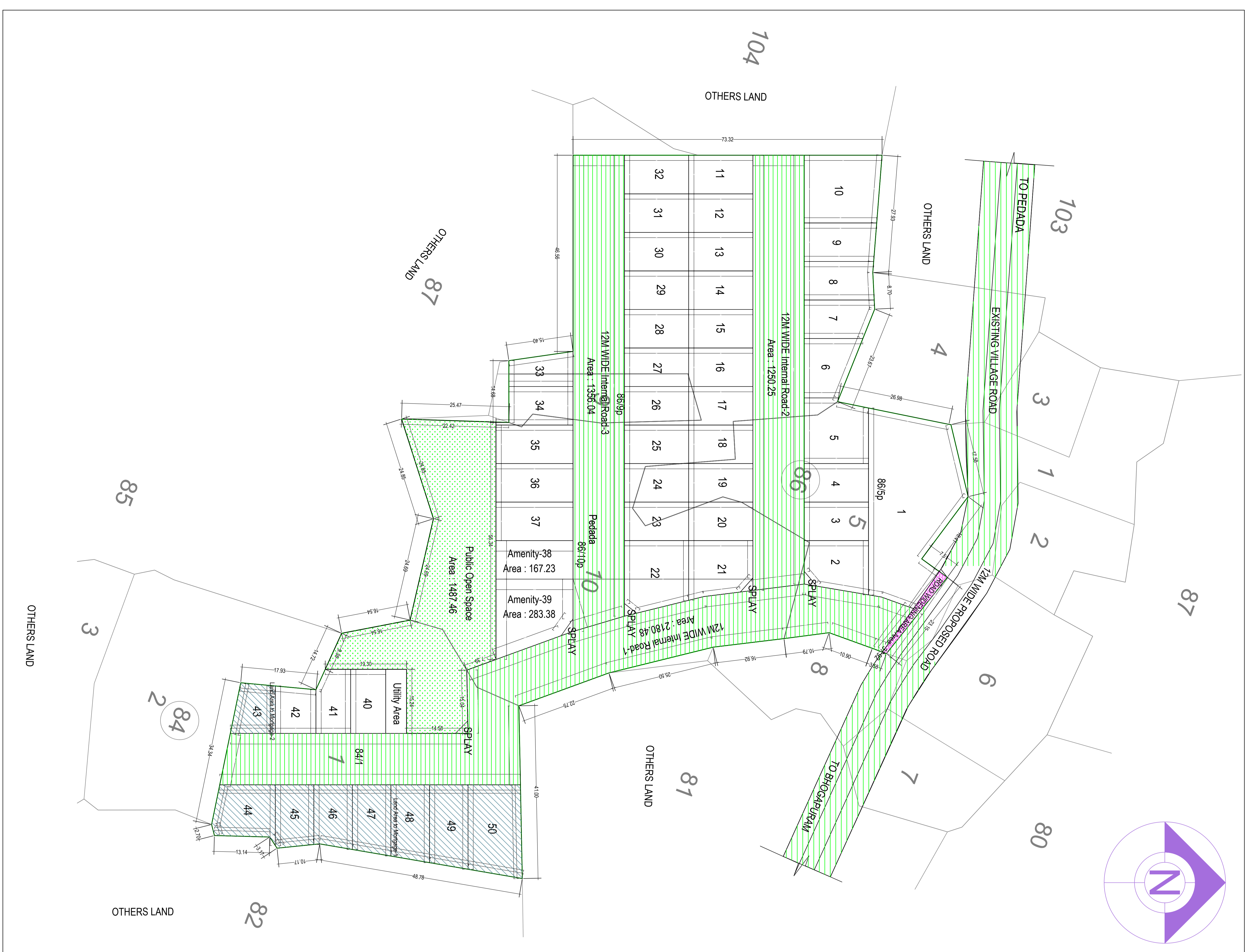
LAYOUT PLAN (Scale - 1:500)