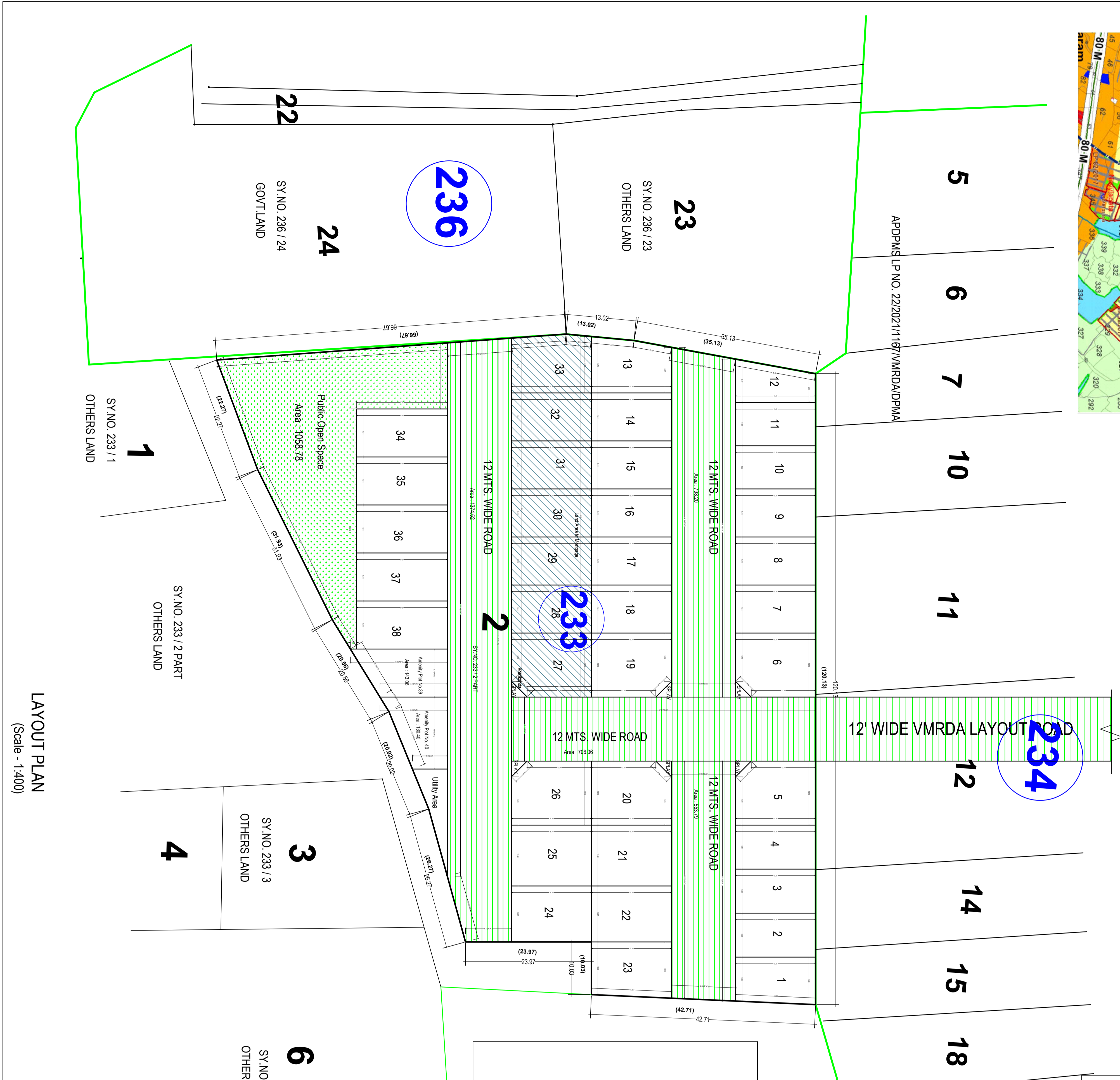
LAYOUT PLAN (Scale - 1:400)