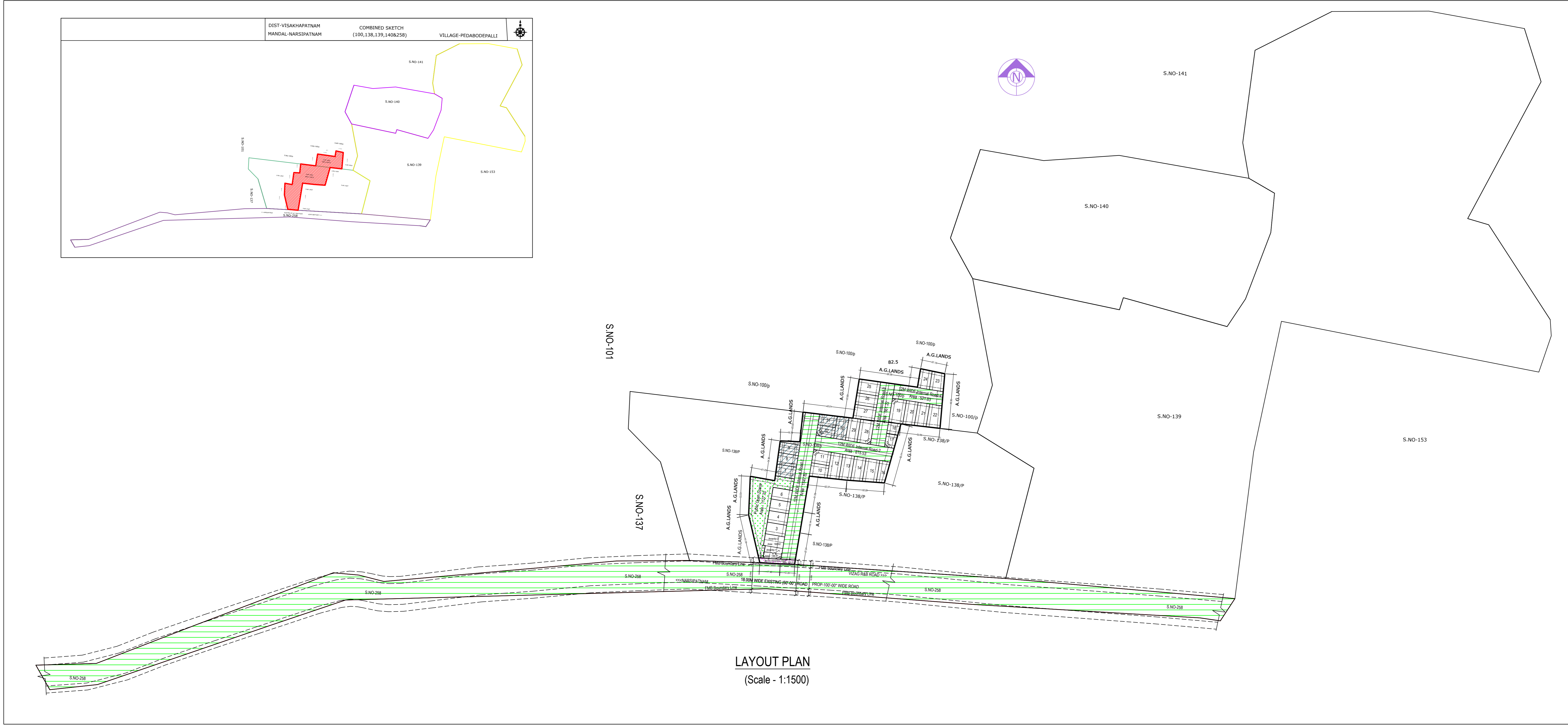
LAYOUT PLAN (Scale - 1:1500)