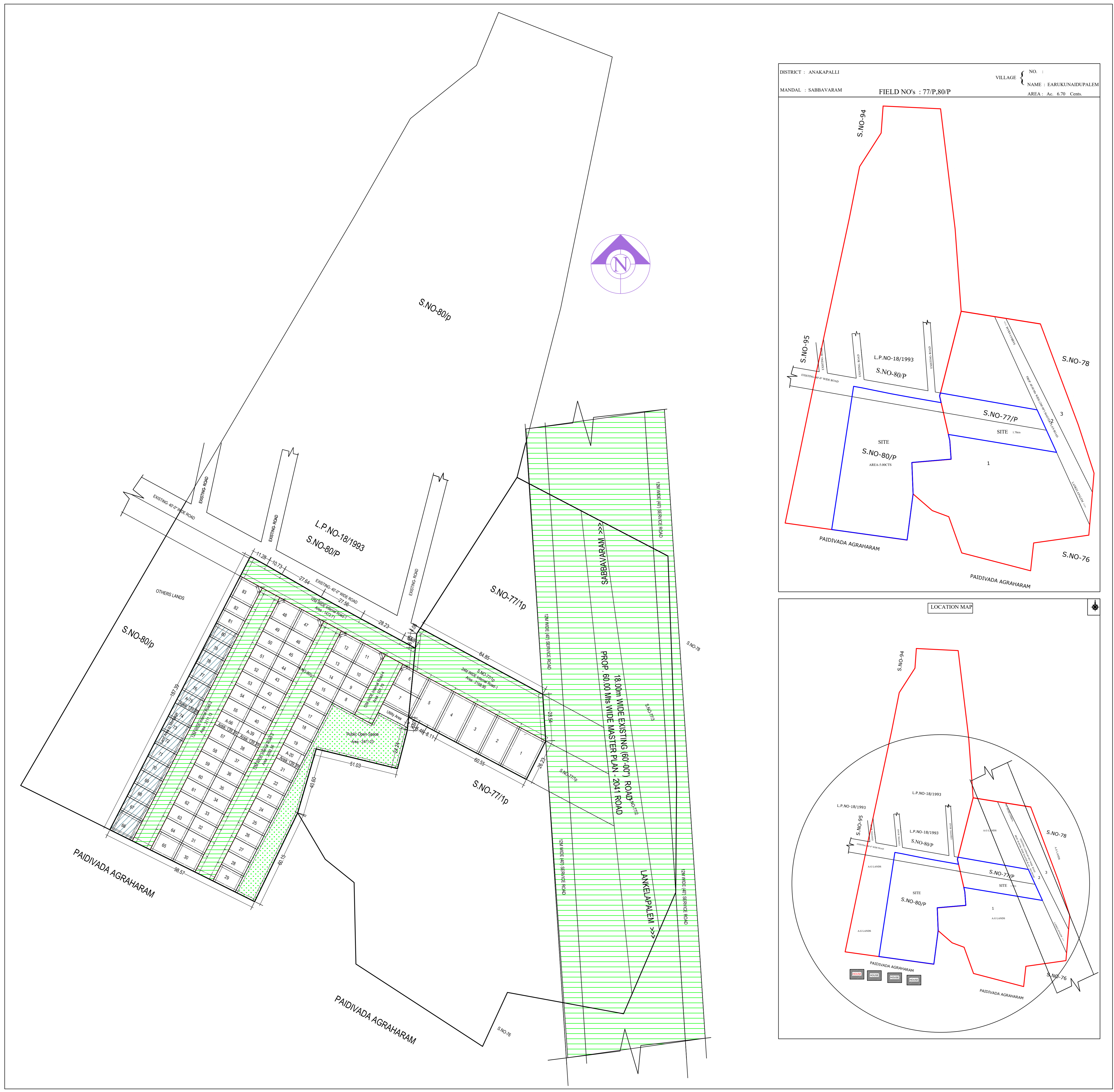
LAYOUT PLAN (Scale : 1:1000)