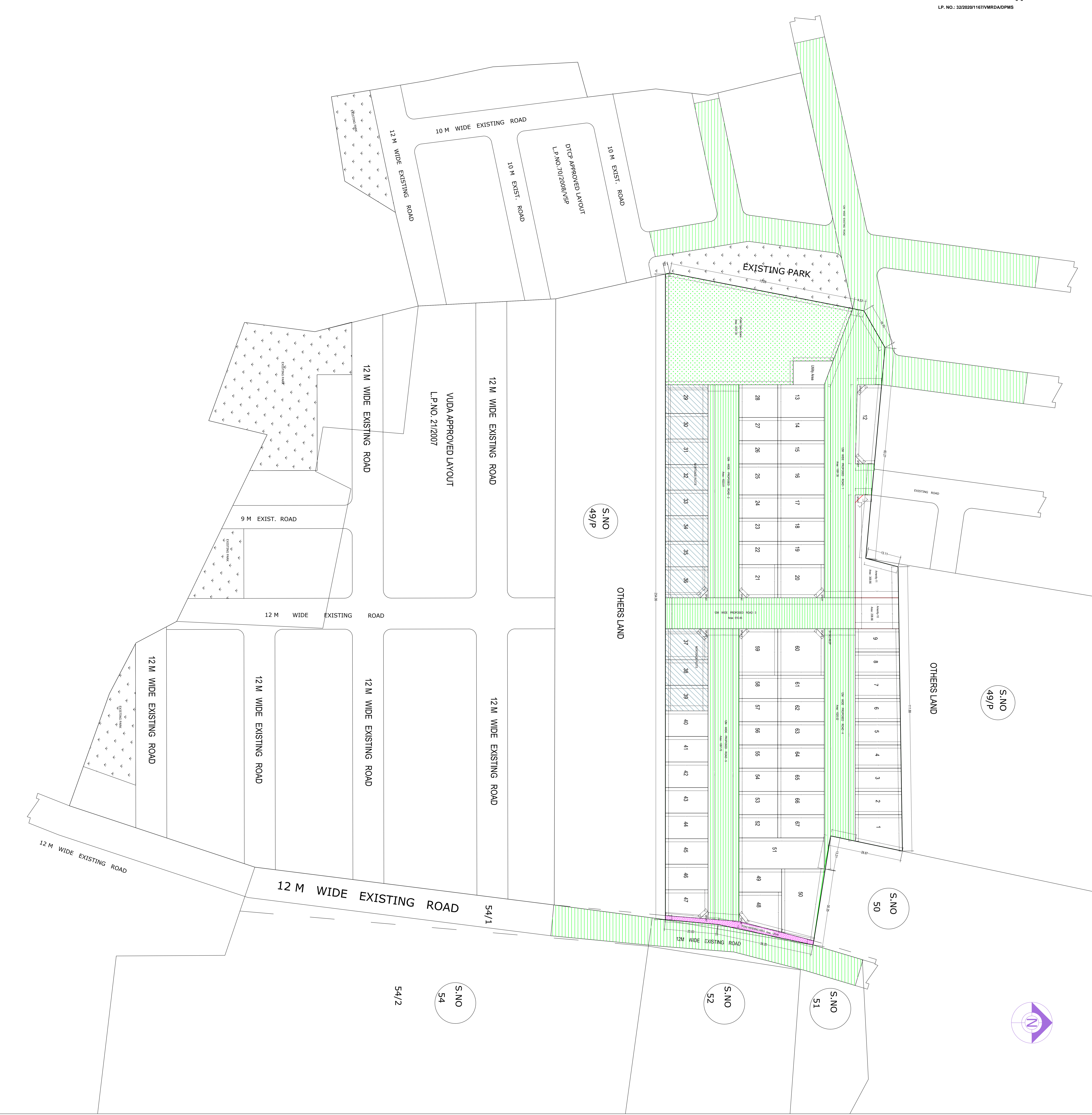
LAYOUT PLAN (Scale - 1:400)