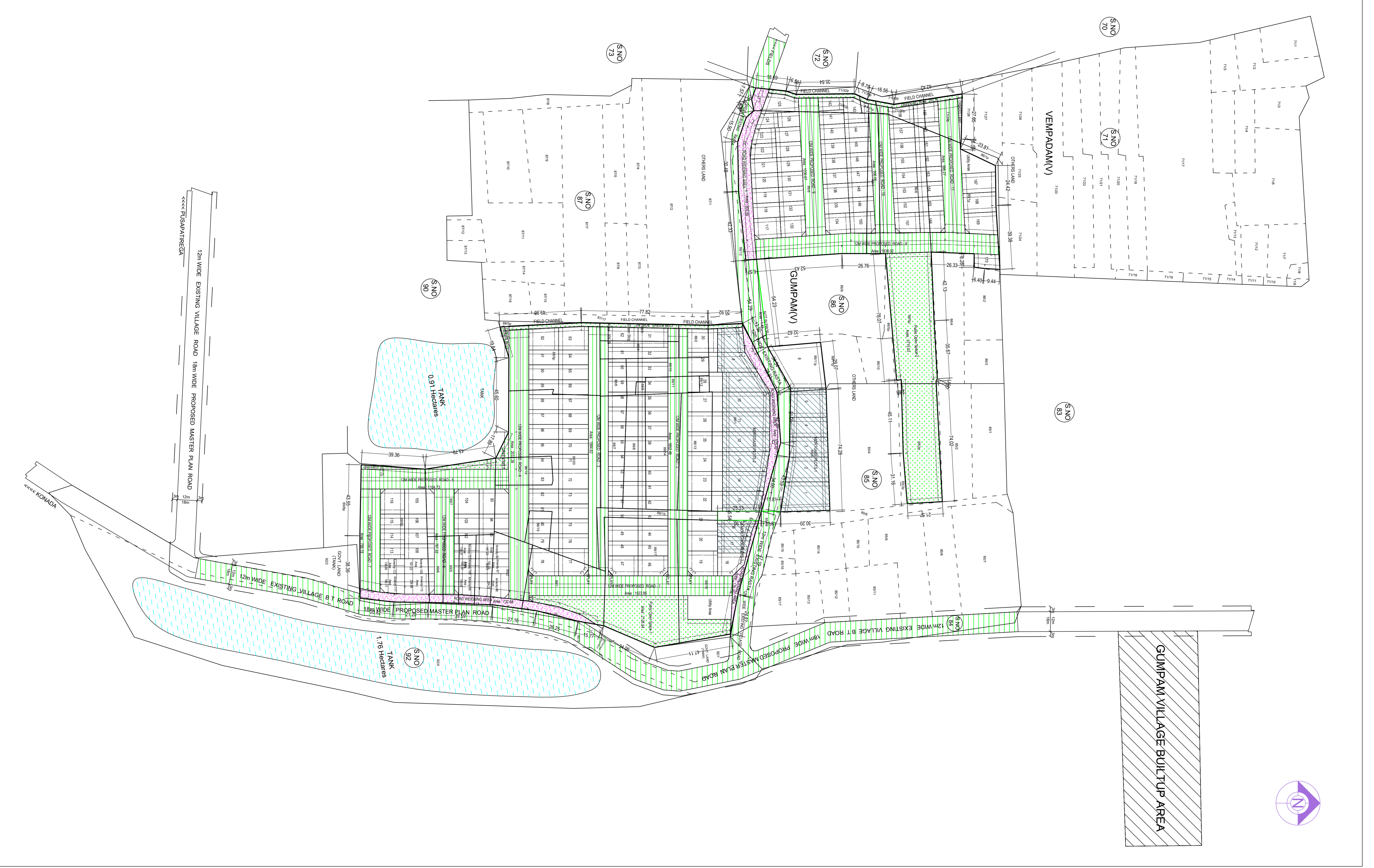
LAYOUT PLAN (Scale: 1:1000)