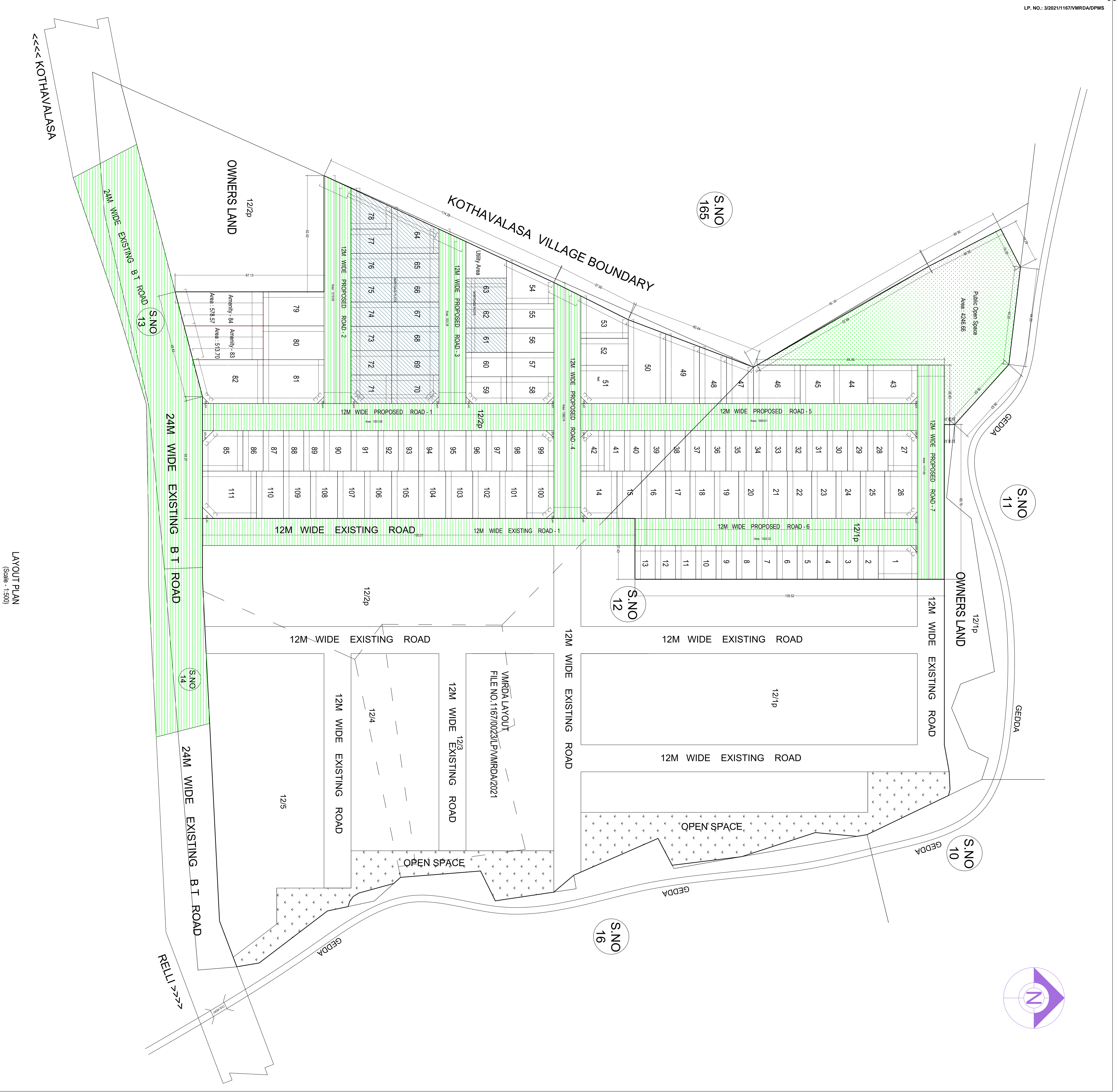
LAYOUT PLAN (8894 - 1580)