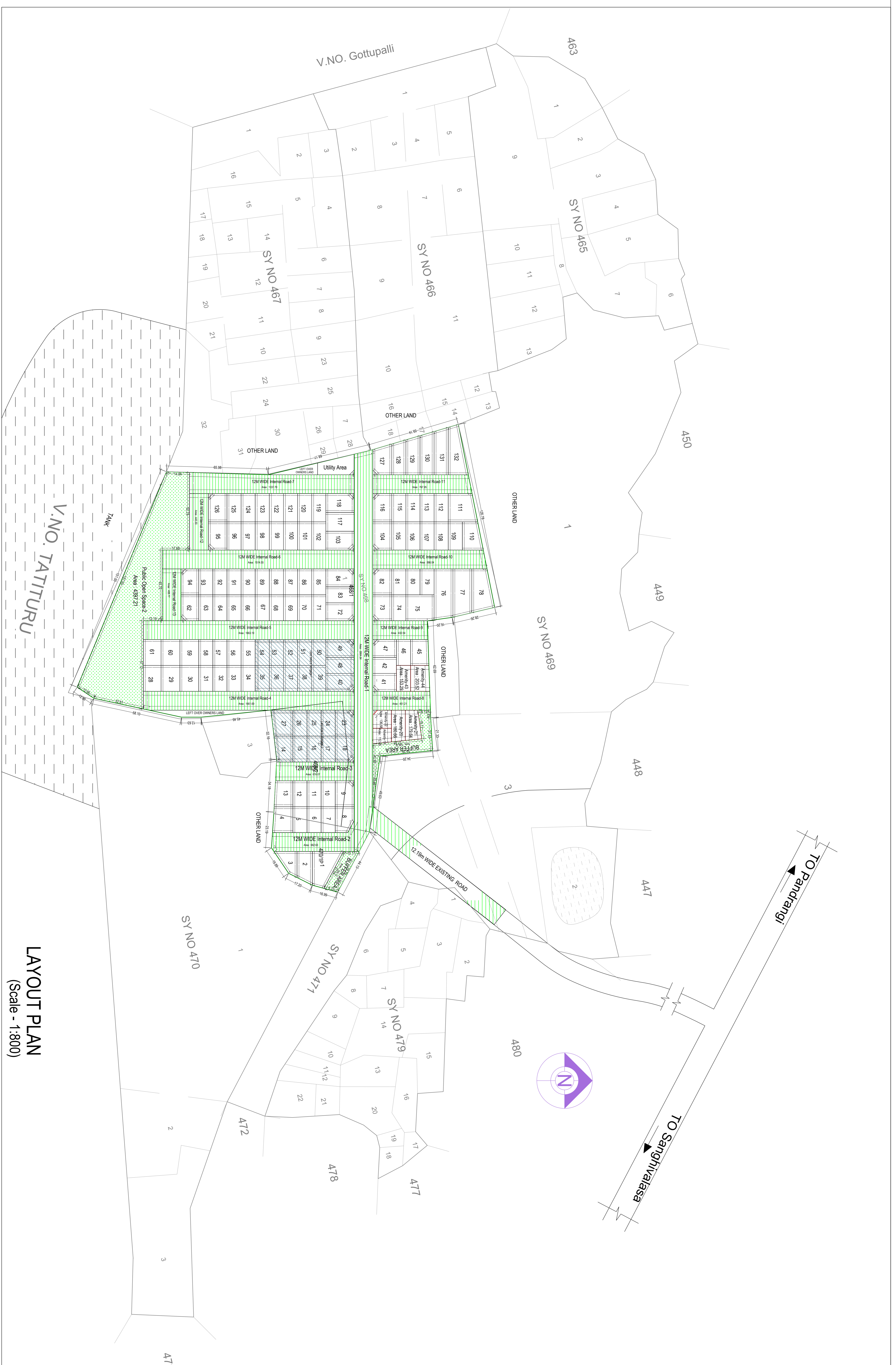
LAYOUT PLAN (Scale - 1:800)