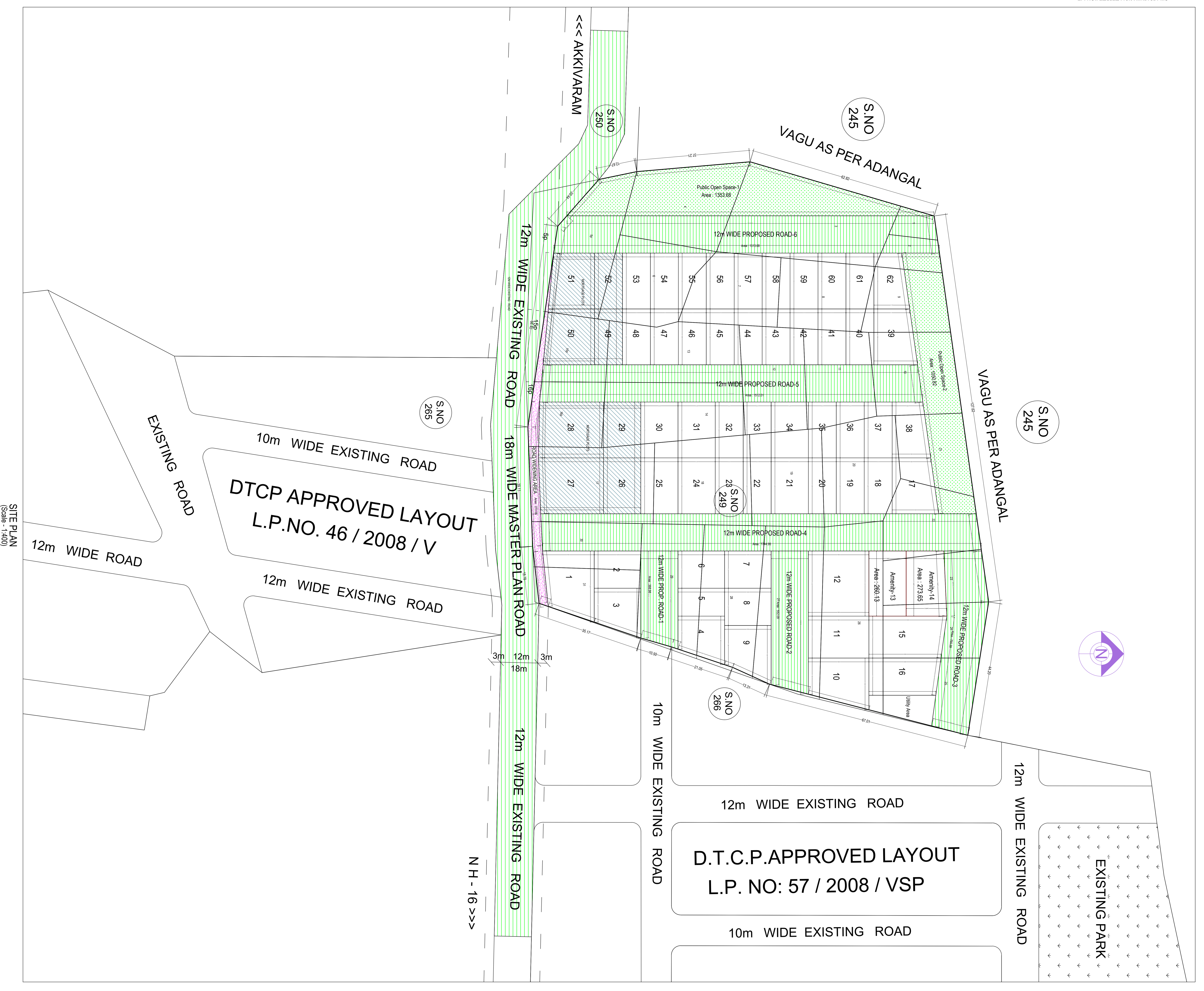
SITE PLAN (Scale - 1:500)