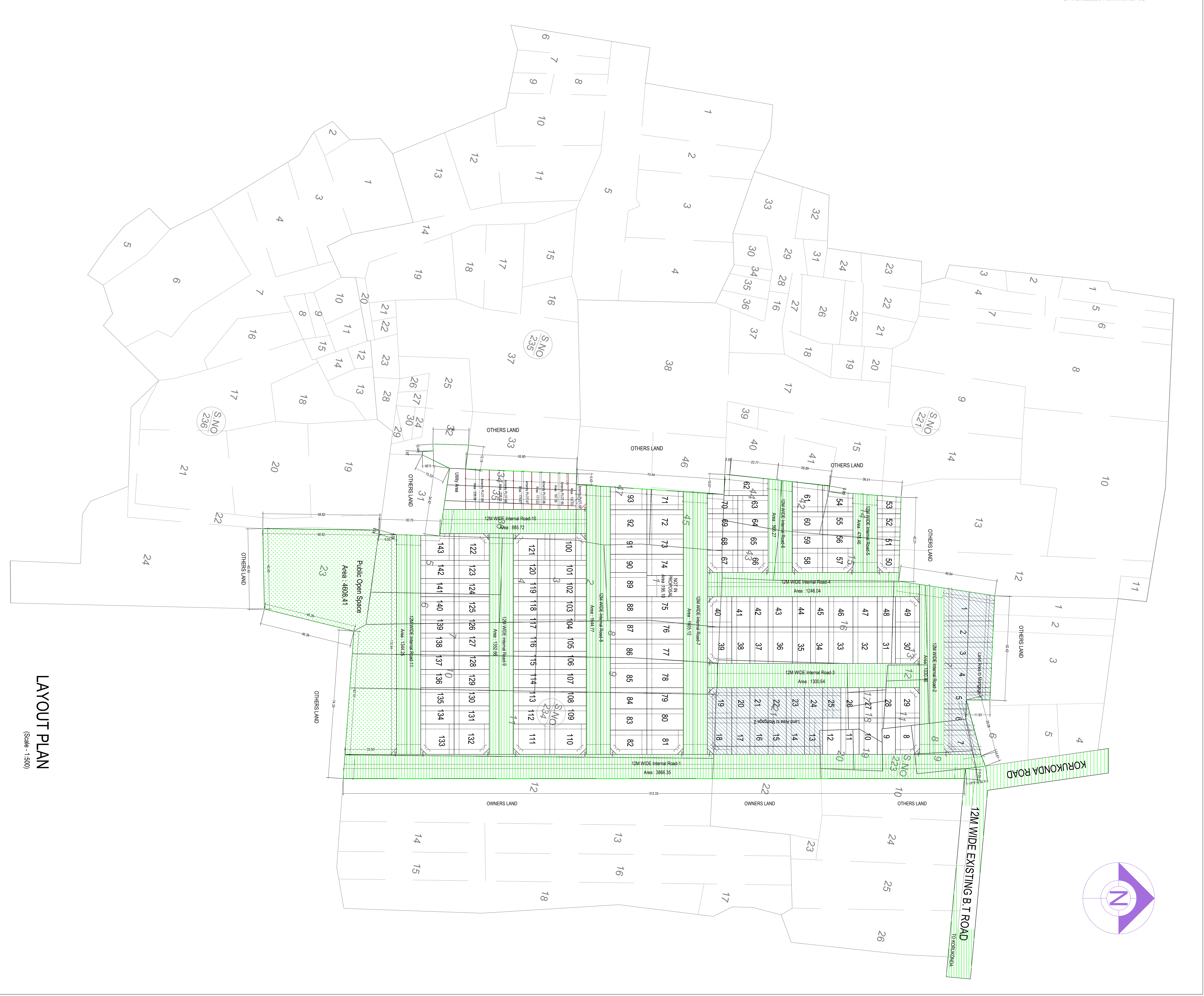
LAYOUT PLAN (Scale - 1:500)