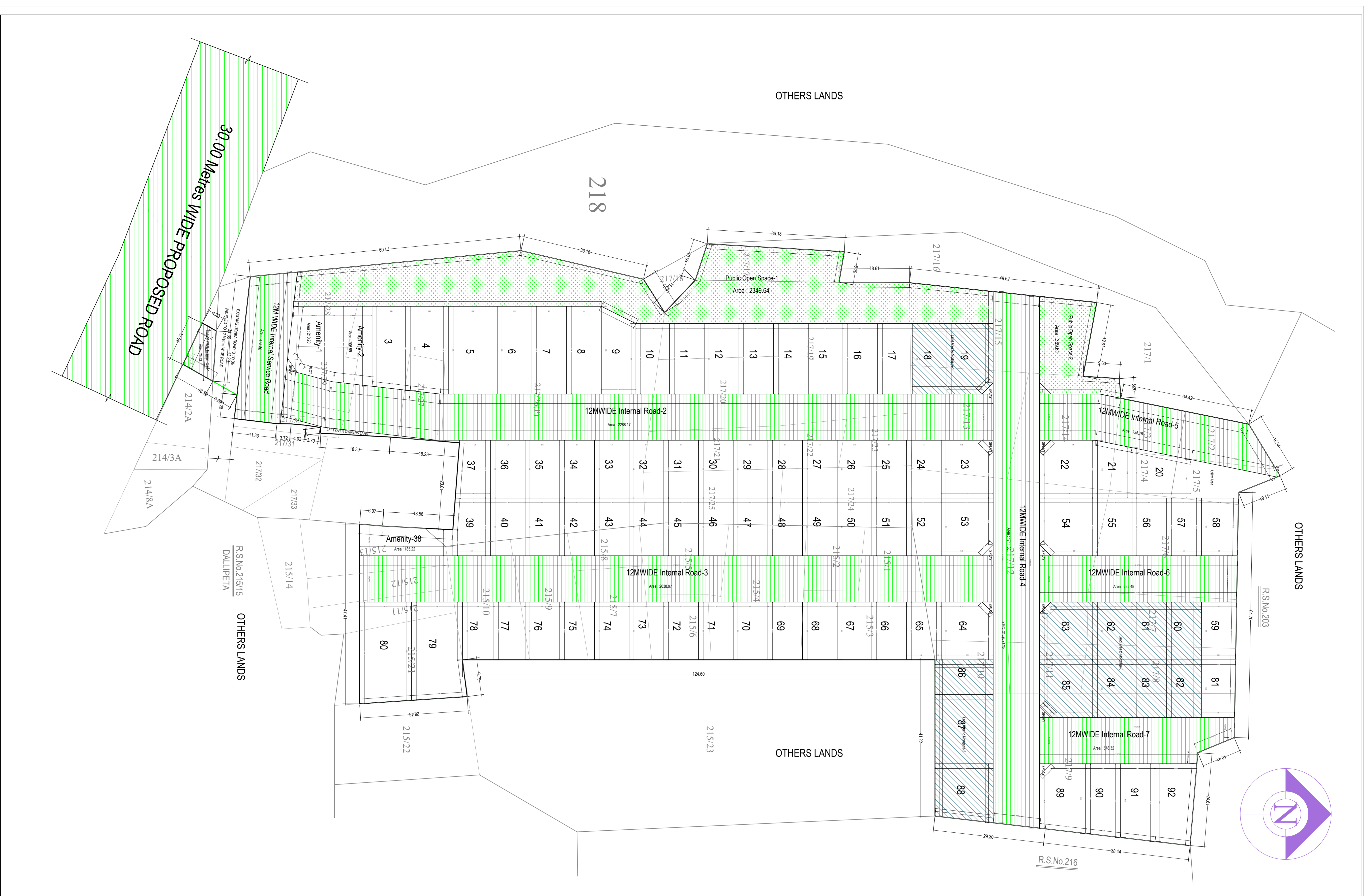
LAYOUT PLAN (Scale: 1:400)