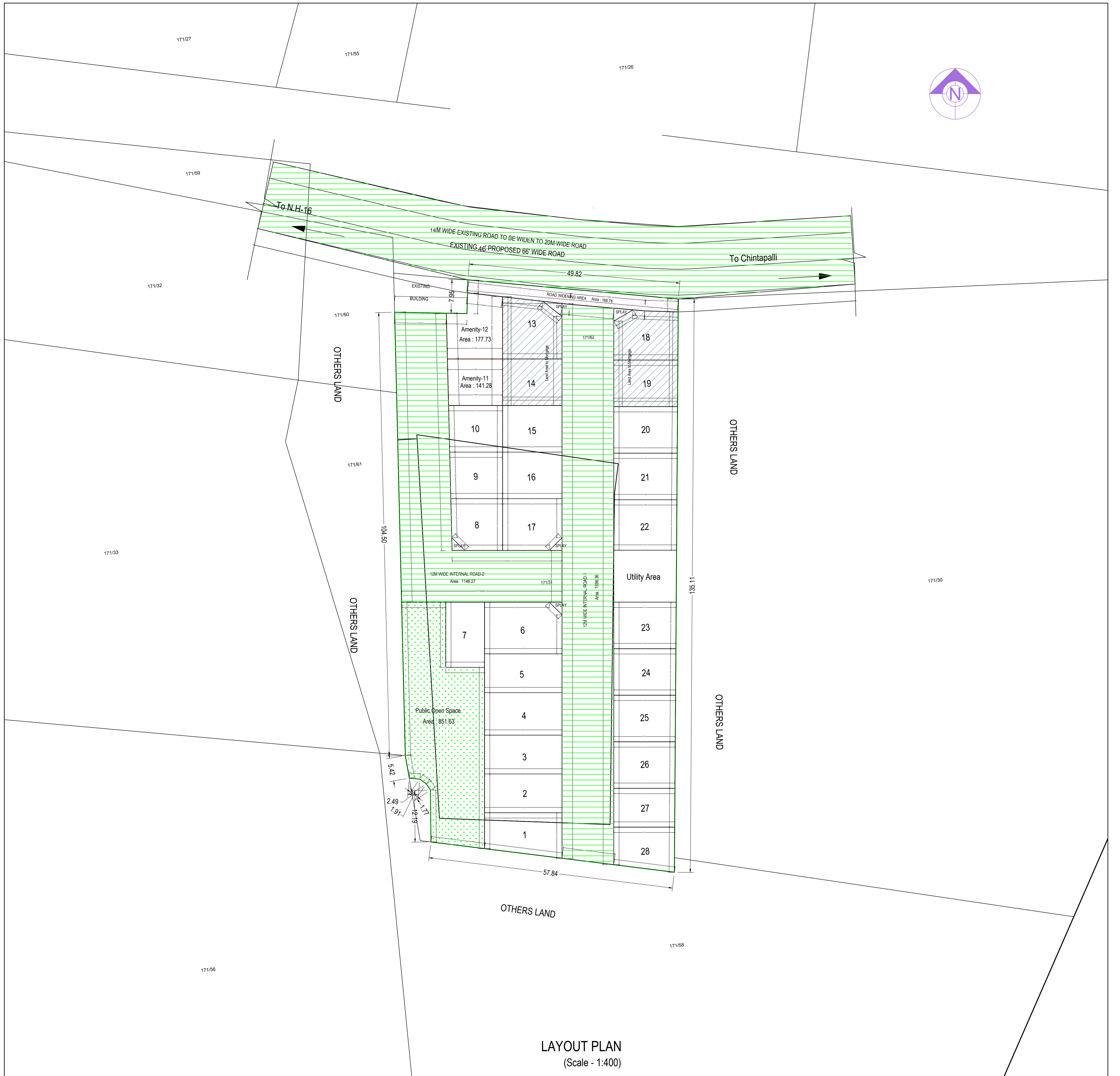
LAYOUT PLAN (Scale - 1:400)