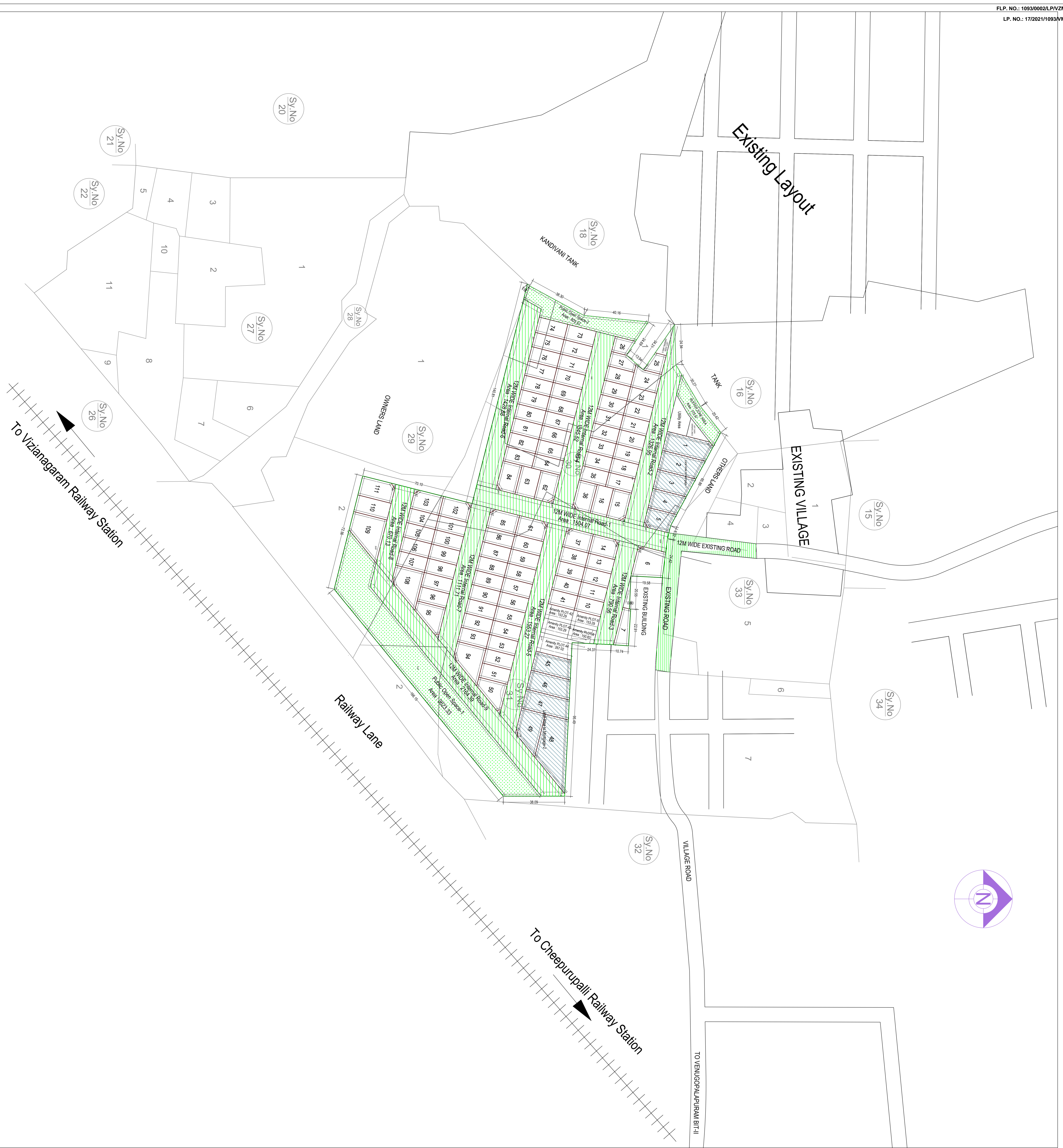
LAYOUT PLAN (Scale - 1:1000)