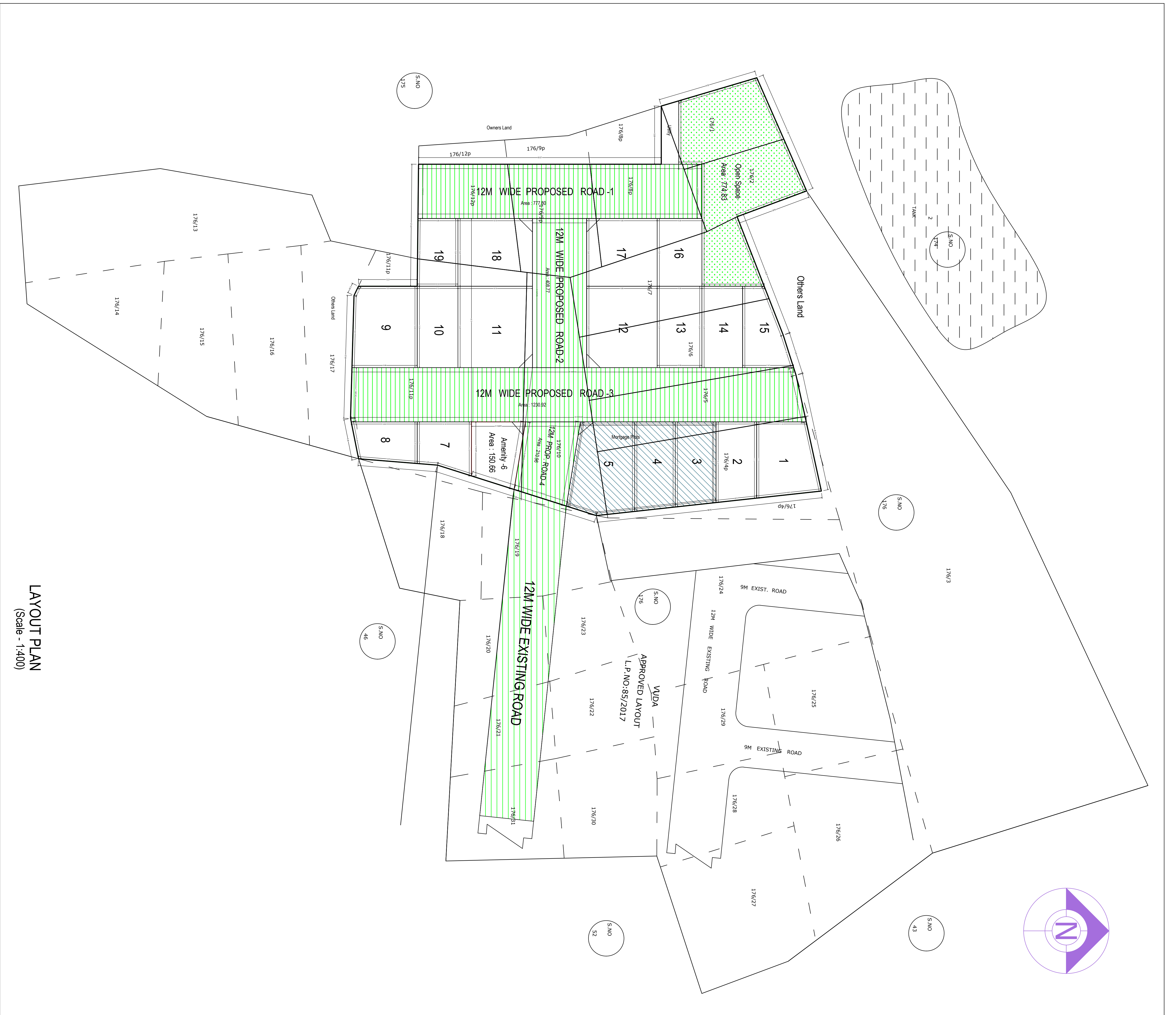
LAYOUT PLAN (Scale - 1:400)