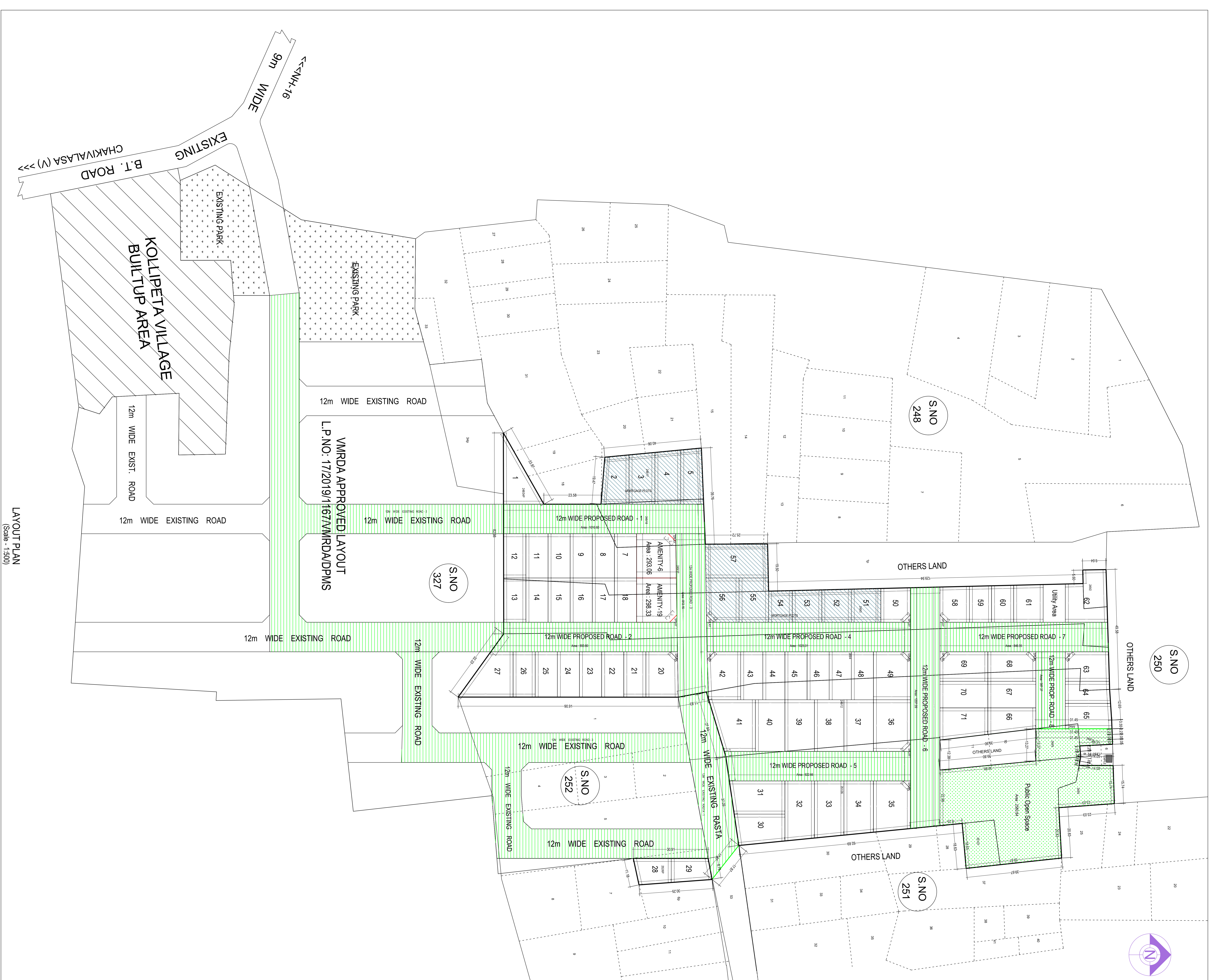
LAYOUT PLAN (Scale - 1:500)