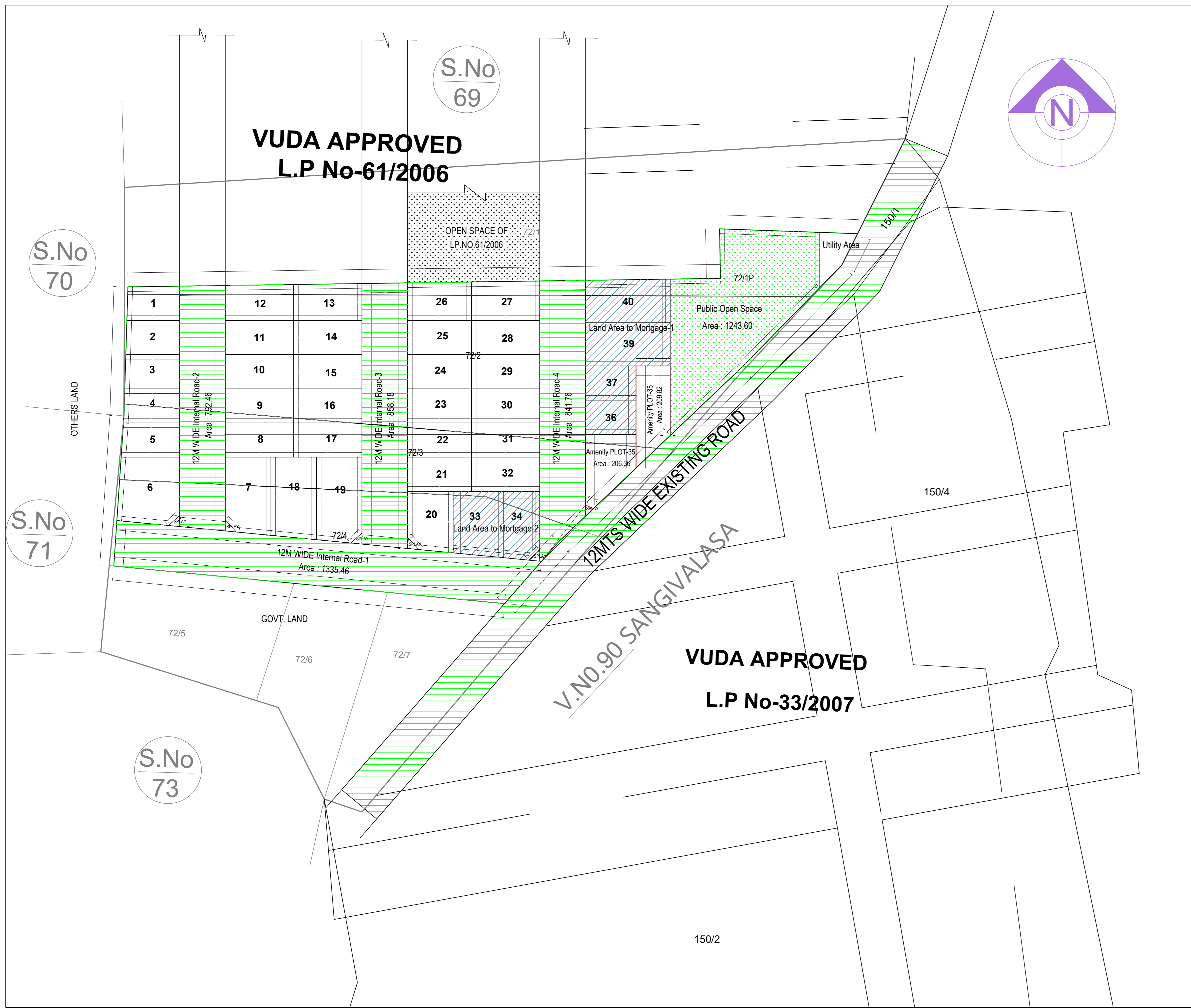
LAYOUT PLAN (Scale - 1:500)