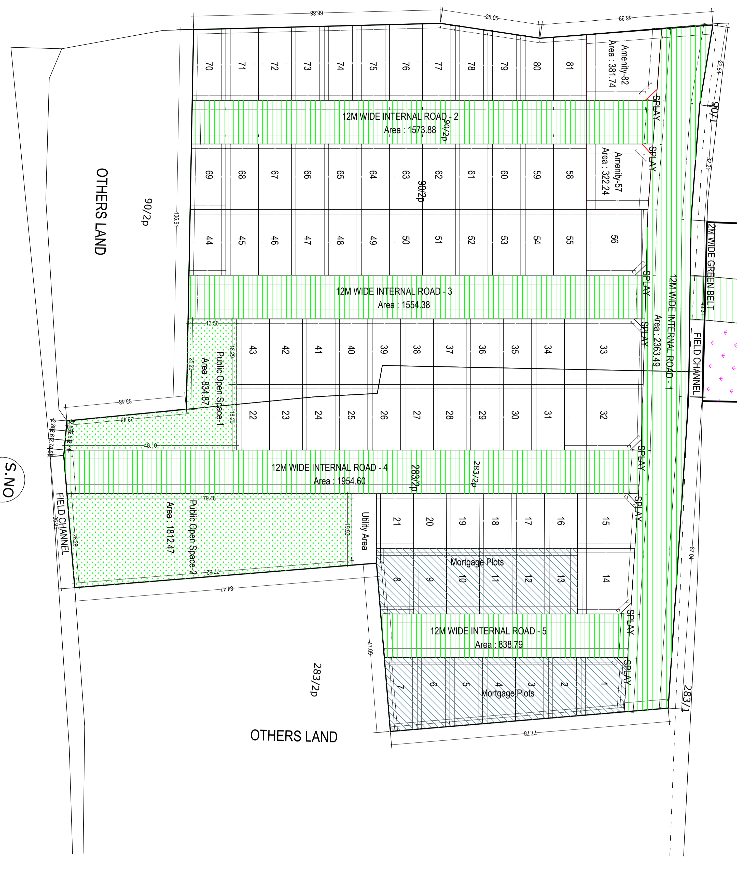
SHOWING LAYOUT IN SY NOS. 90/2p, 283/2p2 & 283/2 TATTURU VILLAGE BHEEMUNIPATNAM MANDAL, VISAKHAPATNAM DISTRICT.