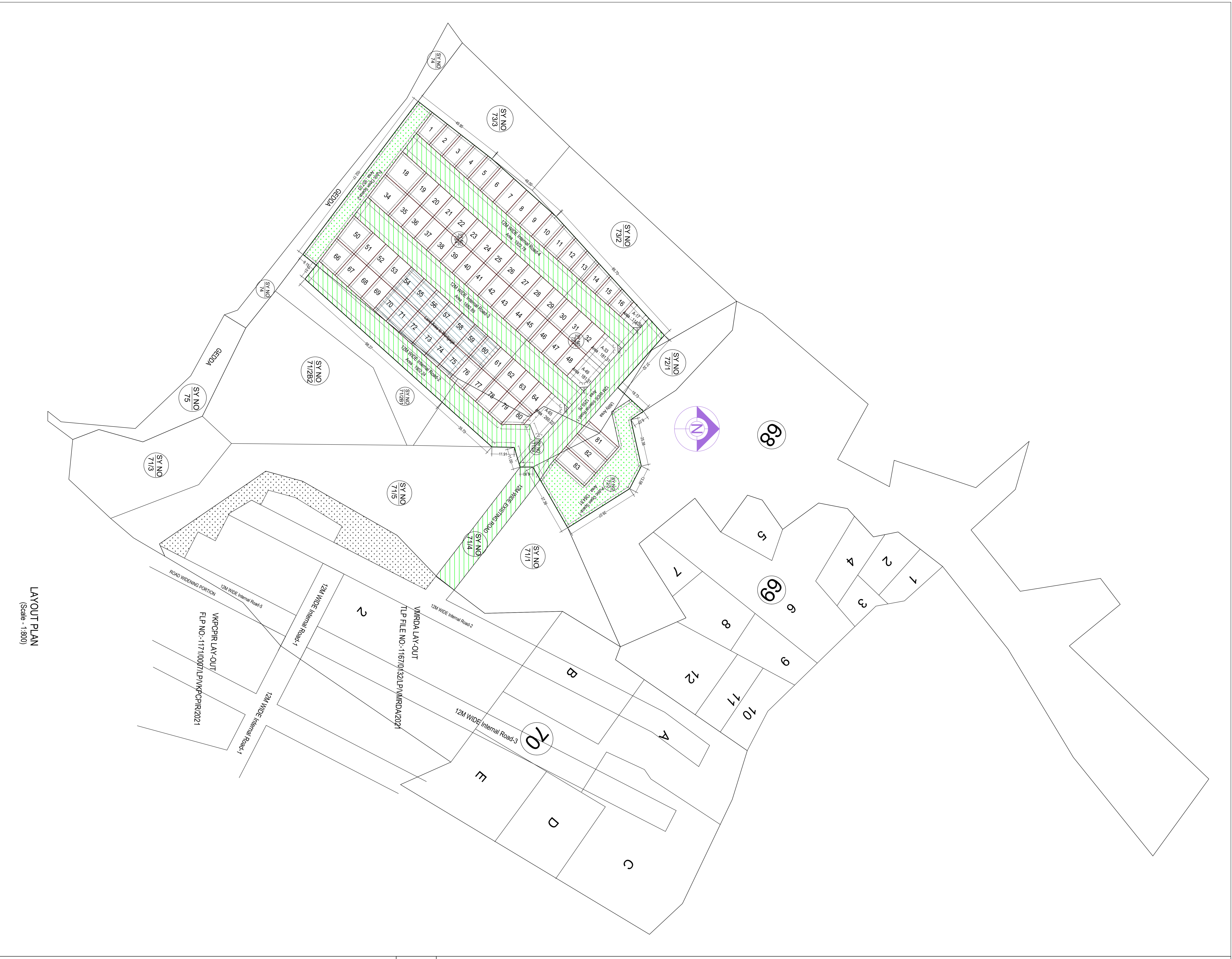
LAYOUT PLAN (Scale - 1:800)