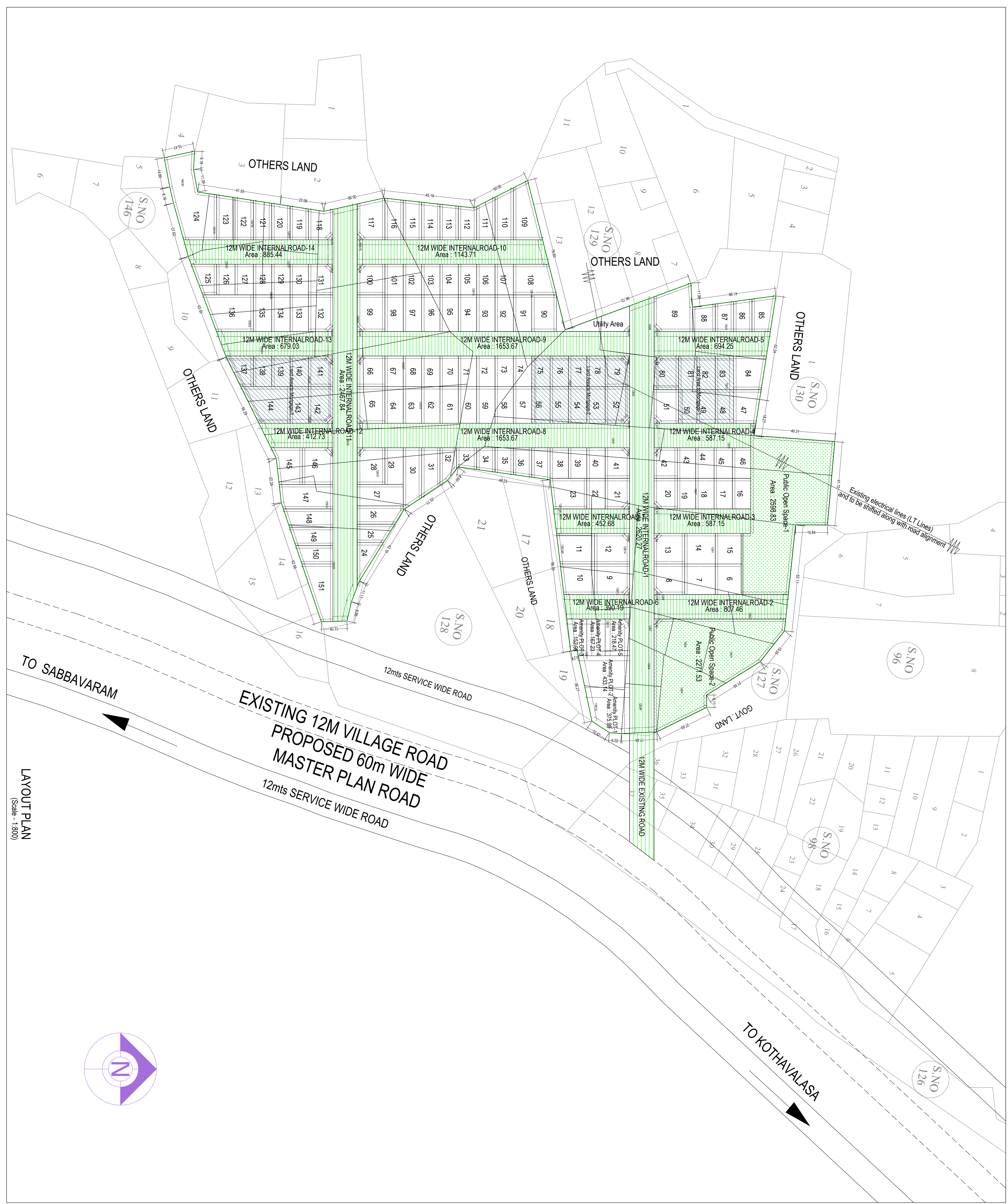
TOPO PLAN SHOWING THE PROPOSED LAYOUT SITE IN S.No. 128P, 129P, 130P, 146P OF GULLIPILLI VILLAGE SABAVARAM MANDAL, VISAKHAPATNAM DISTRICT