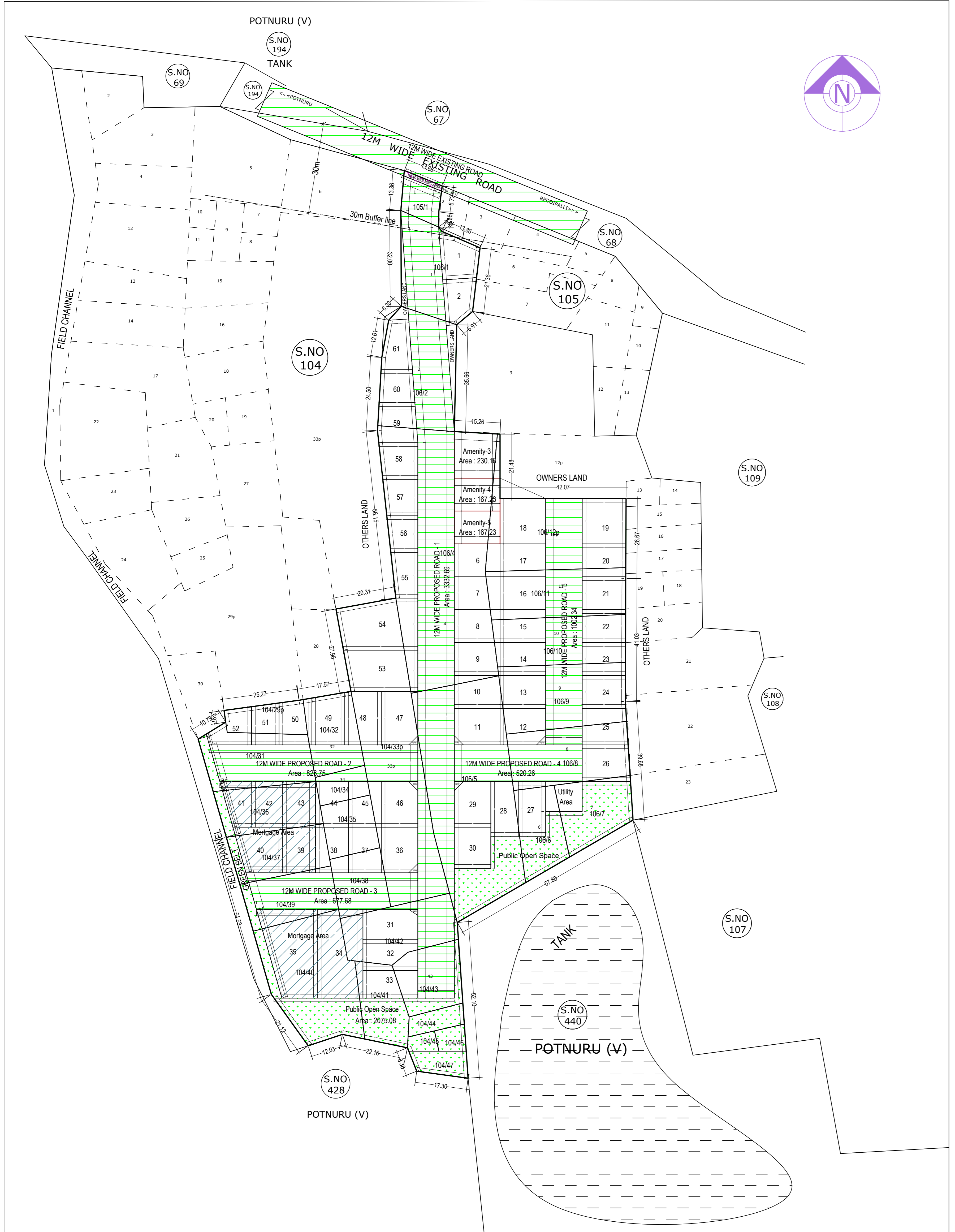
LAYOUT PLAN (Scale - 1:800)