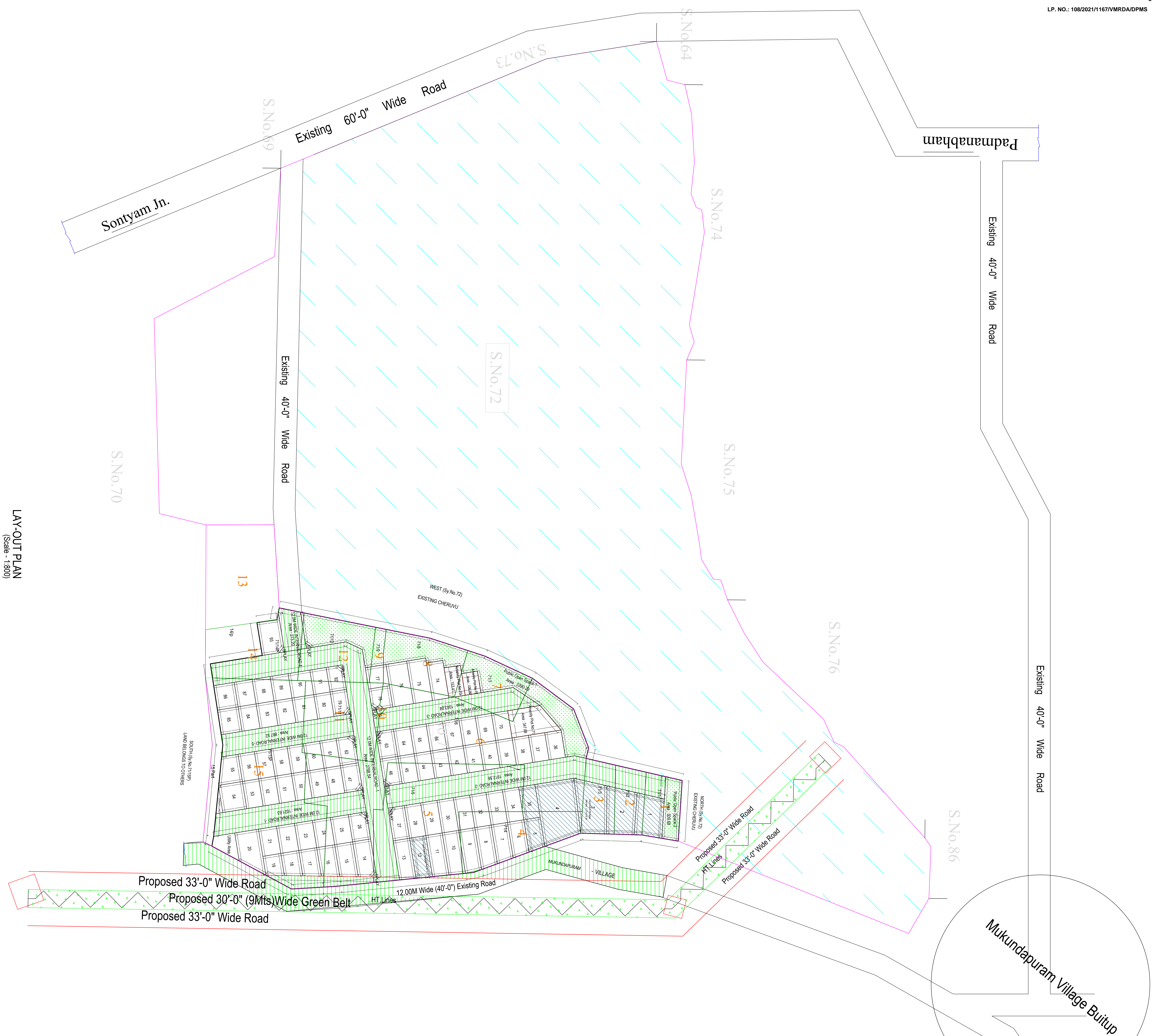
LAY-OUT PLAN (Scale - 1:800)