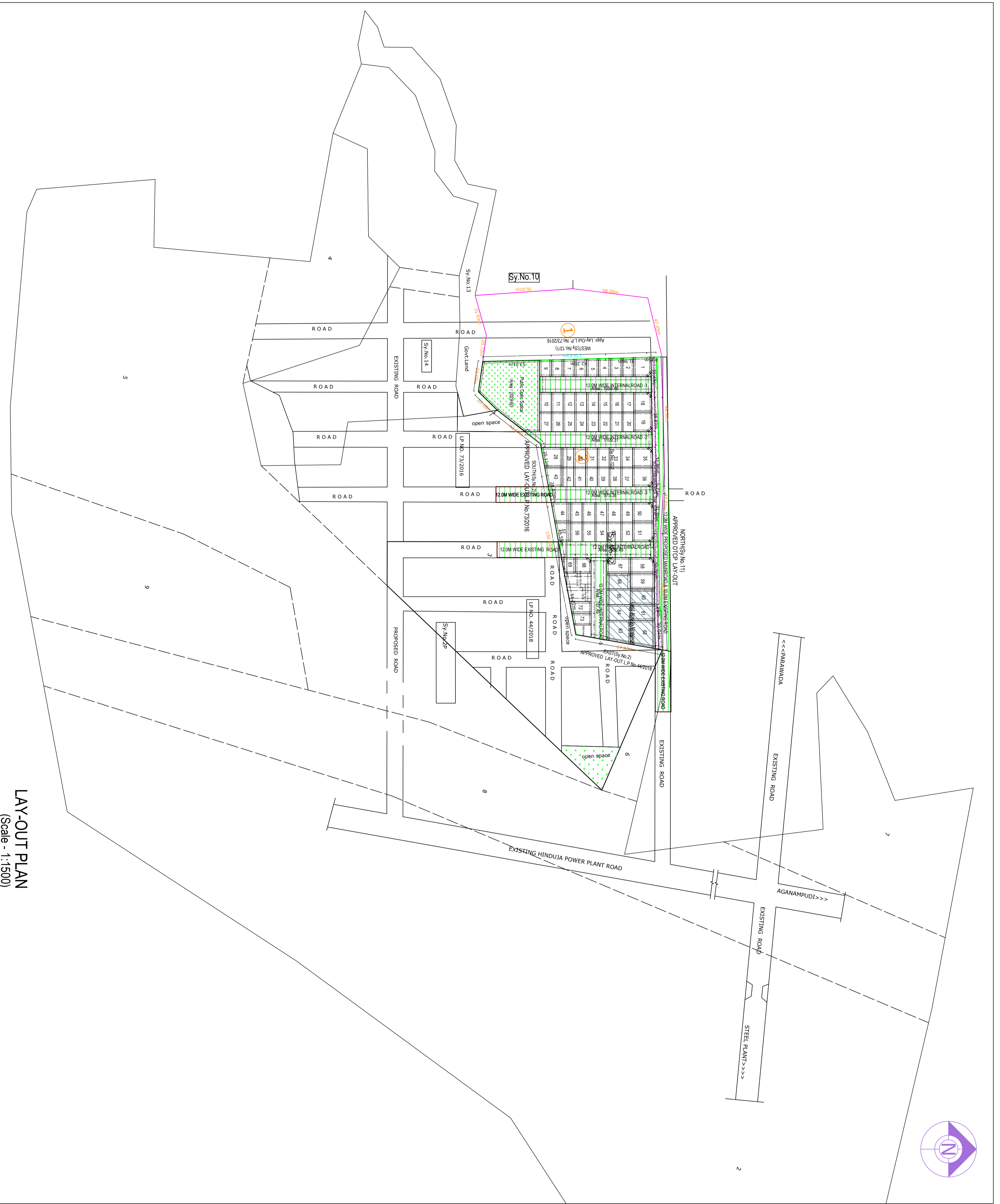
LAY-OUT PLAN (Scale - 1:1500)