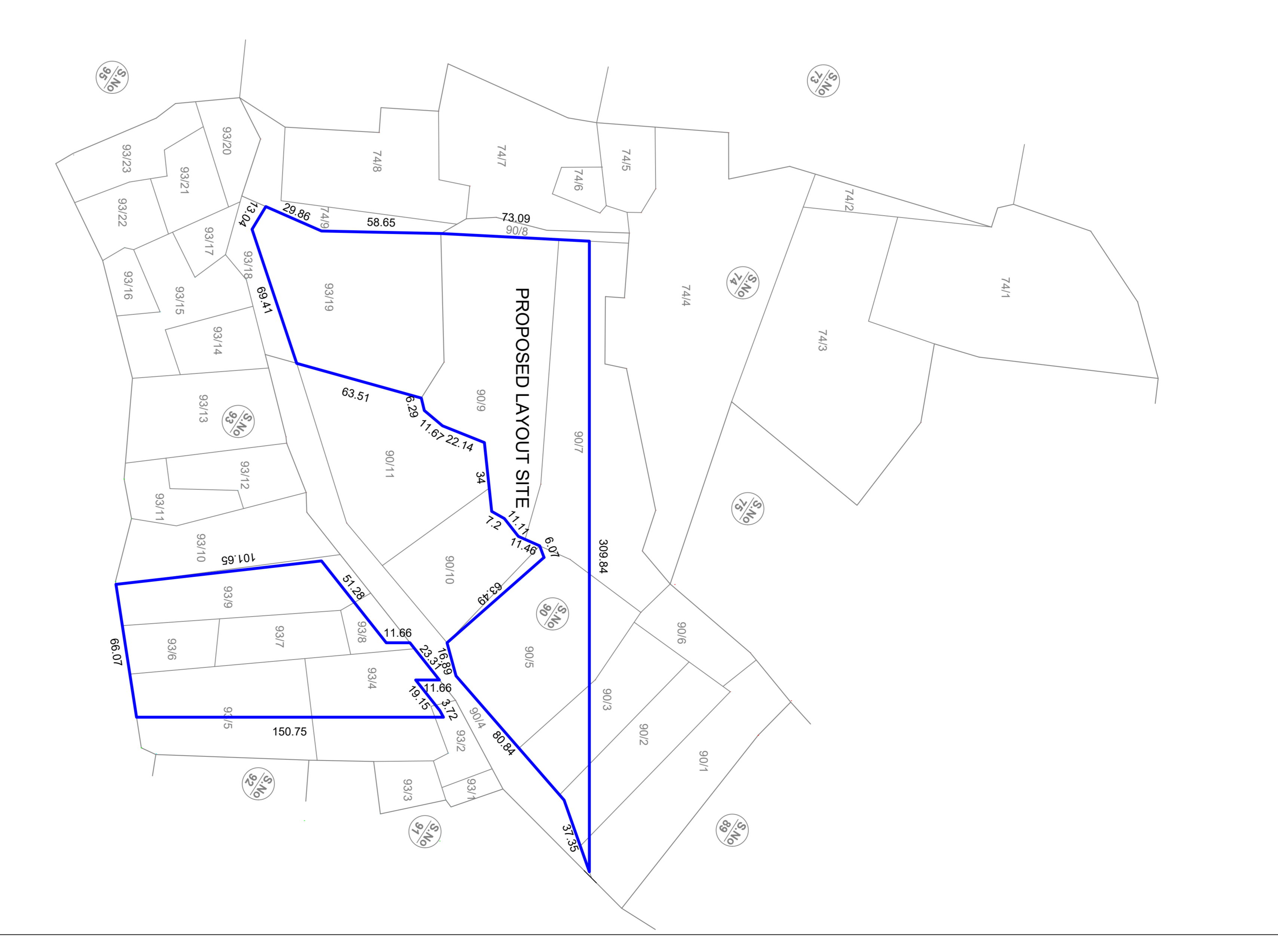
TOPO PLAN SHOWING THE PROPOSED LAYOUT SITE IN S.Y. Nos 90P & 93P OF RELLU VILLAGE, KOTHAVALLASA MANDAL, VIZIANAGARAM DISTRICT