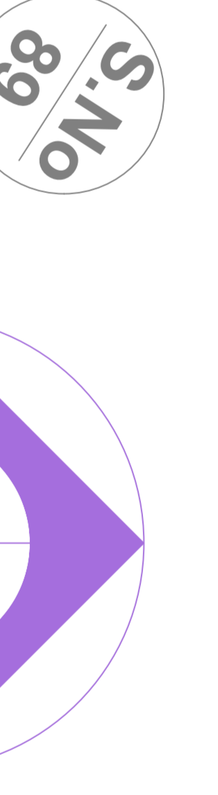
COMBINED SKETCH SHOWING THE PROPOSED LAYOUT IN S.Y. Nos 90P & 93P OF RELLU VILLAGE, KOTHAVALLASA MANDAL, VIZIANAGARAM DISTRICT