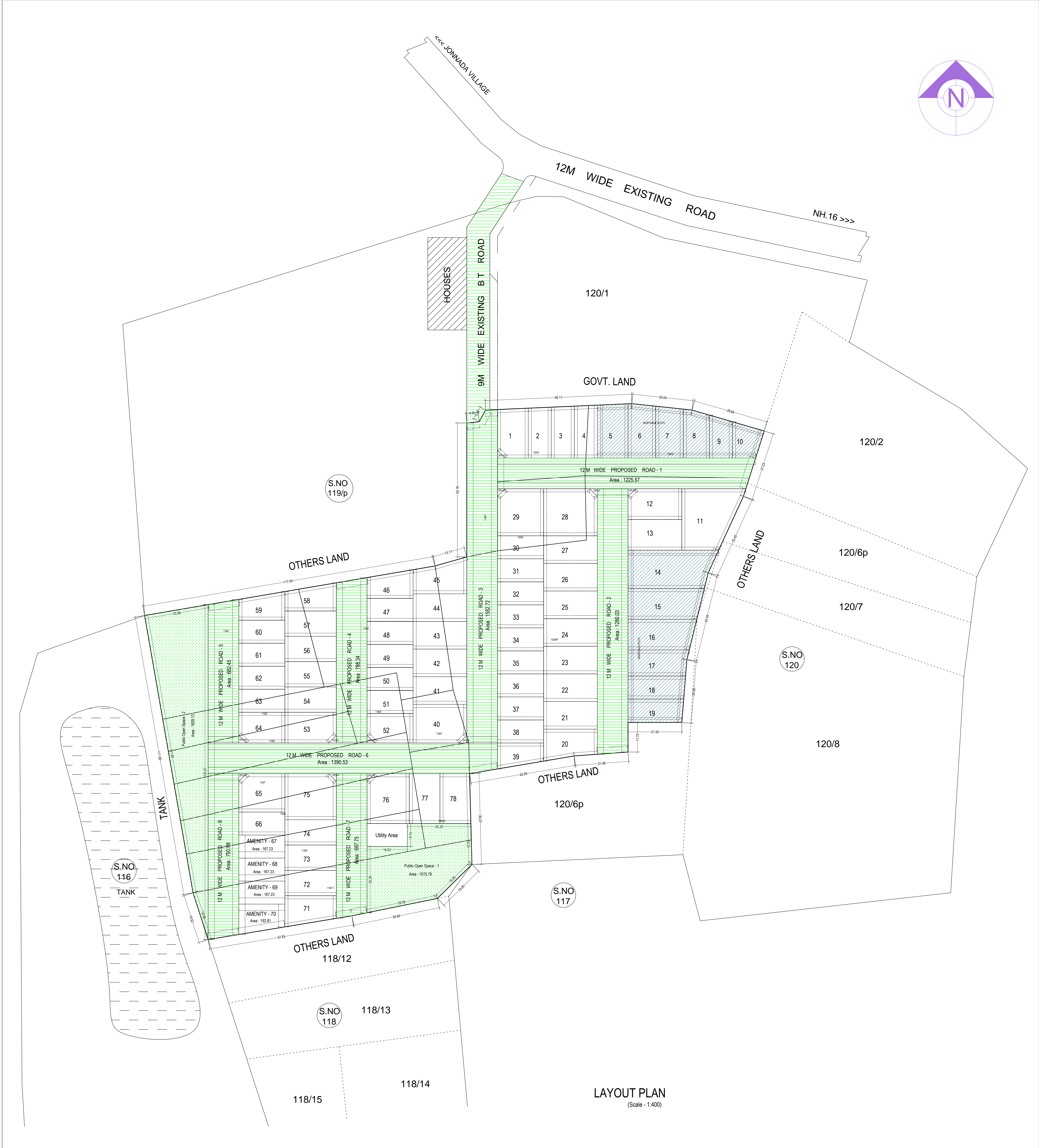
LAYOUT PLAN (Scale - 1:400)